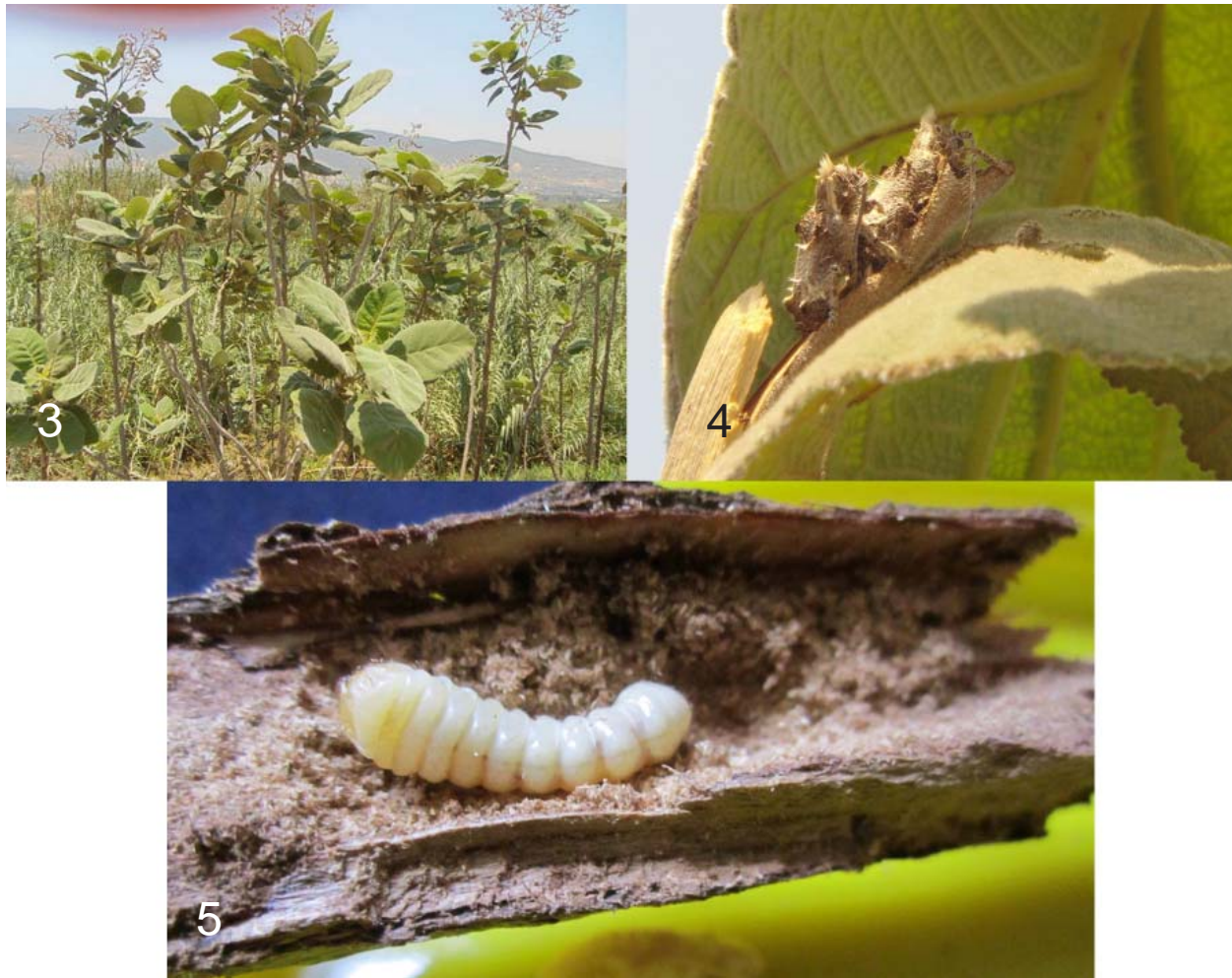
Figures 3-5. Wigandia urens (Ruiz and Pavón) H.B.K. with Desmiphora hirticollis . 3) Host plant. 4) Mating pair. 5) Larva in host stem.

Duffy, E. A. J. 1960. A monograph of the immature stages of Neotropical timber beetles (Cerambycidae). British Museum of Natural History; London. 327 p.