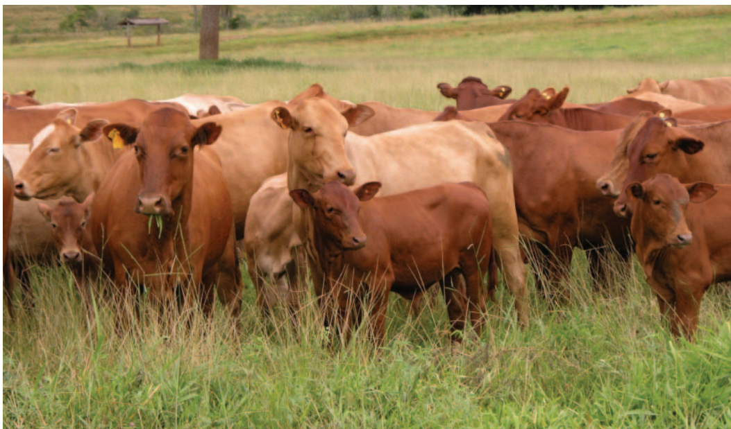
Figure 3. Montana bulls in Brazil.

Beef production in Latin America is very important and has great potential for growth. Despite the general difficulties encountered in developing well-funded, long-term genetic evaluation programs in Latin America for beef cattle, some examples of success are emerging. Genetic evaluations are very well established and developed in several breeds, such as the Nellore, Angus, Hereford, Braford, and Brangus. In these breeds, important advances should come with nontraditional breeding programs using GS. Significant increases in the accuracy of selection are expected with the use of more dense panels of DNA markers because the results of studies using fewer than 200 markers have revealed increases of more than 60% in the accuracy of breeding value estimates.