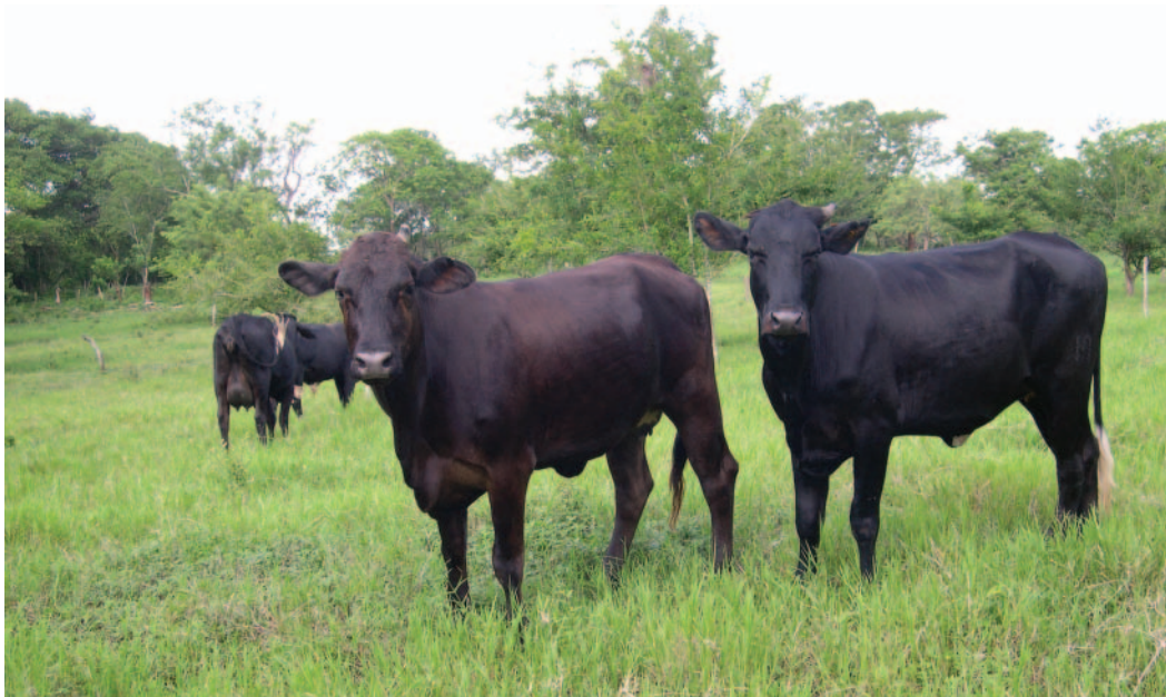
Figure 1. European × Zebu crossbred cattle from Mexico.

Mexico is based mainly around the production of B. taurus taurus cattle (Peel et al., 2010; Arelovich et al., 2011; Domingues Millen et al., 2011).