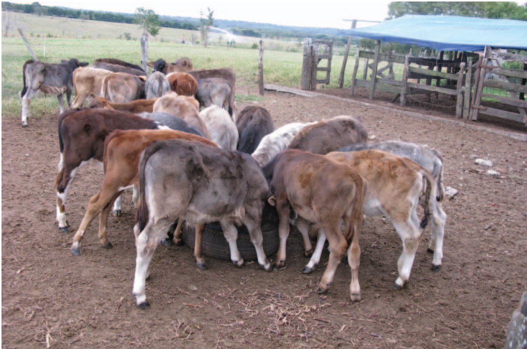
Figure 2. European × Zebu crossbred calves in Mexico.

In Mexico, the Brown Swiss breed undergoes genetic evaluations for growth traits and scrotal circumference by the Universidad Autónoma Chapingo.