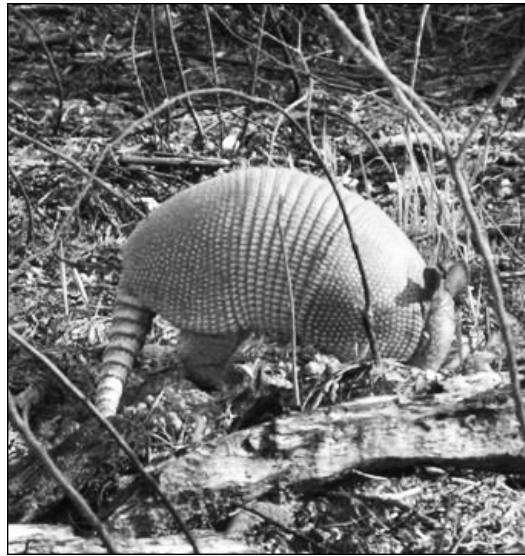
Nine-banded armadillo foraging. A primary concern of landowners with armadillos is the damage caused by their foraging behavior.

We captured 41 armadillos using long-handled dip nets and unbaited wire cage traps (Hawthorne 1994). All armadillos were captured and handled in compliance with the University of Georgia's Animal Care and Use Committee (IACUC) project A2004-10138-0. We assigned captured armadillos randomly