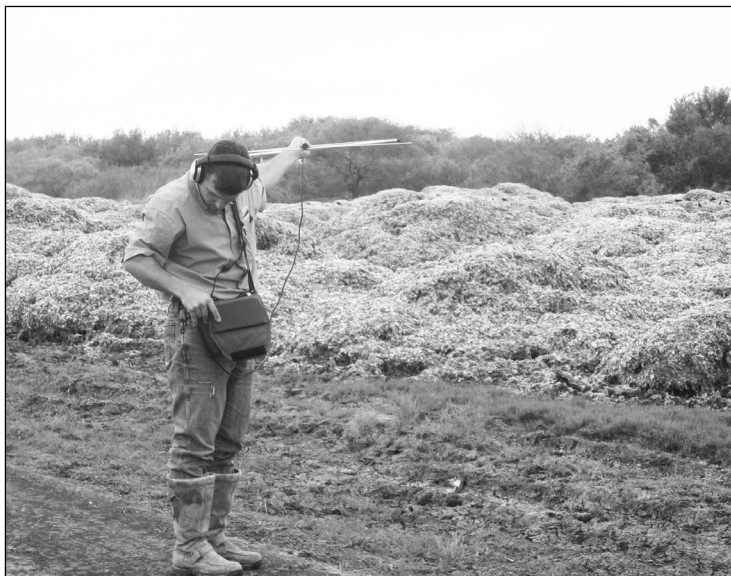
Figure 1. Study personnel using ground-based radio-telemetry to locate feral swine at a whole-cottonseed storage site in Kleberg County, Texas, during February 2008.

We collected samples of cottonseed from various areas at the storage sites where feral