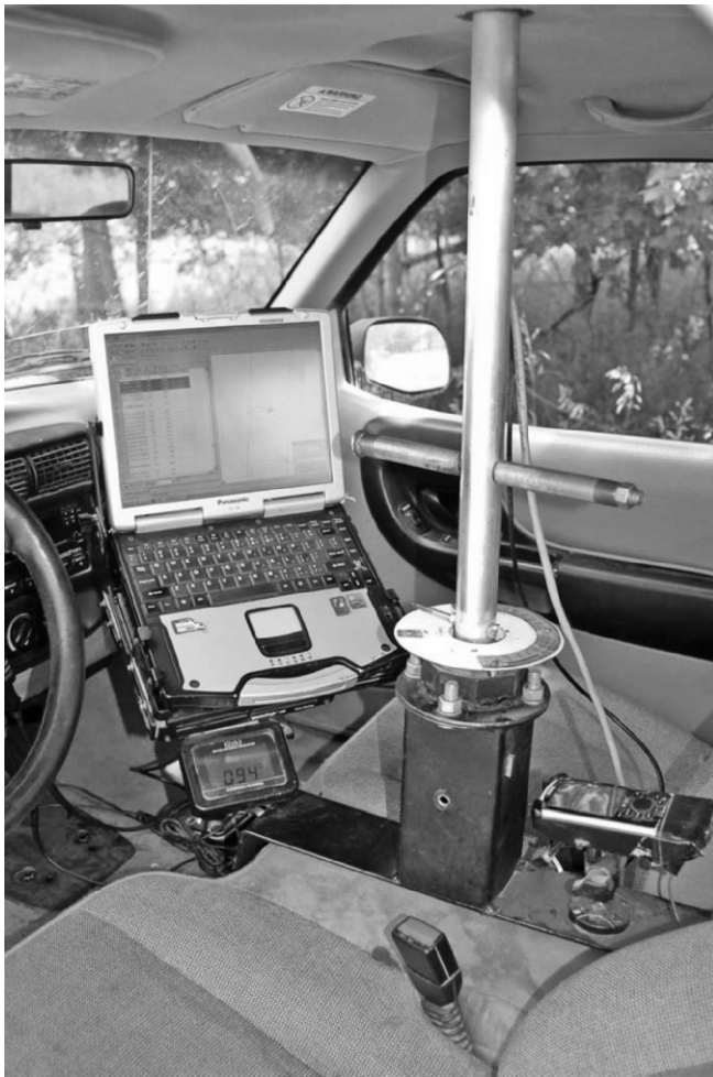
Figure 1. Integrated vehicle-mounted telemetry system showing primary components, tested in Nebraska, USA.

bearing, estimate transmitter location, and to enter data for each transmitter.