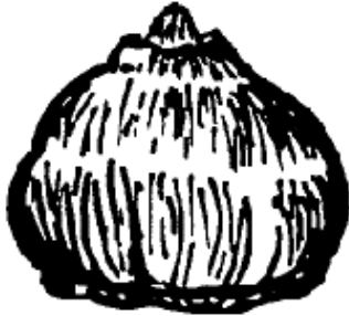
Figure 1. Gladiolus corm.

Glads grow from underground food storage structures called corms. Corms are solid masses of tissue, rather than layered like true bulbs. Corms have growing points on their upper surface, and are actually compact stems ( Figure 1 ).