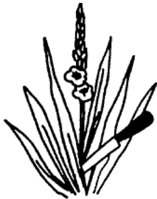
Figure 4. Cut glads leaving at least four leaves on the plant.

Glads are primarily grown for use as a cut flower. To get the most enjoyment from flower spikes, pick when the first florets are beginning to open. The remaining florets will open in time.