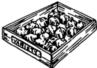
Figure 5. Store glad corms in labeled trays at 35-45 degrees F.

Place corms in a light, warm, well-ventilated place for several weeks to cure. Corms are cured to get rid of excess moisture in corm and husks as rapidly as possible. This helps prevent storage problems.