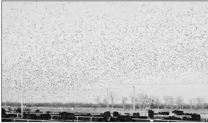
Figure 1. Hundreds of starlings hover over a cattle feedlot.

epidemiological evidence has directly linked starlings in the spread of pathogens among feedlots. If starlings were acting as pathogen vectors to cattle, the most likely transmission route would be through livestock ingestion of starling feces from contaminated water and feed (Foster et al. 2006).