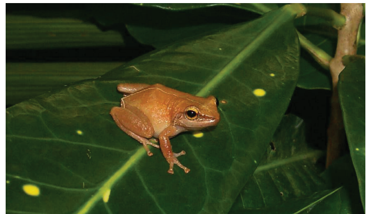
Figure 1. A typical coqui frog on a Codiaeum variegatum leaf.

For the last 15 years, many options to control frogs have been considered, but few have been proven effective and safe. Prior to this time, very little research had been conducted on managing invasive frogs anywhere in the world. The problem with developing a control method for frog populations was the method needed to be effective against individual frogs, would be applied over large areas, be effective in a variety of environments, be safe for non-target plants and animals, and be safe and effective to implement by the general public. After