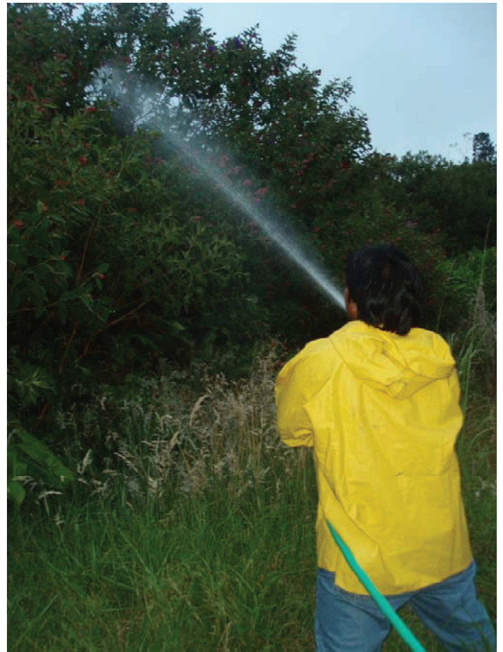
Figure 3. Hand spraying a 16% citric acid solution to target coqui frogs in vegetation. The hose is connected to a 400 gallon mobile tank system (USDA APHIS Wildlife Services' National Wildlife Research Center).

Biological control can also have unintended consequences that affect other organisms or the environment. If a disease were found that significantly affected coqui frogs, there is a chance that a frog infected with a disease could be transported to other states or countries. Thus, releasing a disease organism may affect frog populations elsewhere and could restrict trade. An effective frog predator, could also switch to eating native species, such as birds, if it greatly reduced frog populations.