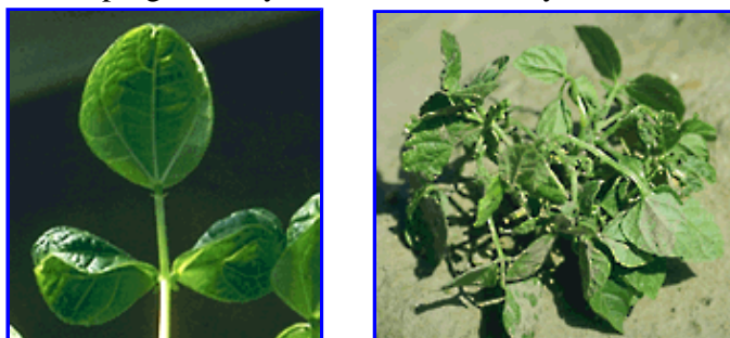
Figure 2. Damage symptoms from Banvel exposure.

Drift damage in the field can usually be recognized by a characteristic pattern. Plants express symptoms in a gradient from one end of the field to the other. Plants nearest to the source of drift will show the greatest damage; this damage will become progressively less noticeable away from the source of drift.