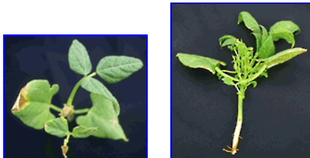
Figure 1. Beans leaves exhibiting typical "growth regulator" herbicide injury caused by Banvel and 2,4-D.

Fieldbeans and soybeans demonstrate characteristic bending and twisting of stems, tumor development, and crinkling of leaves within hours of being exposed to 2,4-D. Exposure to 2,4-D is usually detrimental to the bean plant, although at very low concentrations, it has been observed to actually increase plant height, leaf size, pod set, and yield.