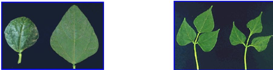
Figure 3. Banvel (left) and 2, 4-D-exposed leaves compared with those of healthy plants.

The use of 2,4-D or Banvel postemergence in cropland adjoining fieldbean or soybean fields poses a potential risk to these crops. To minimize this risk, these herbicides must be used with caution.