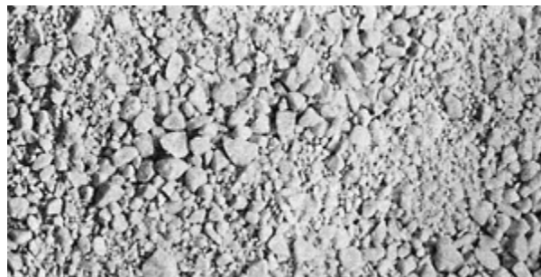
b. Medium: 40% effective - less than 8 mesh but greater than 60 mesh.