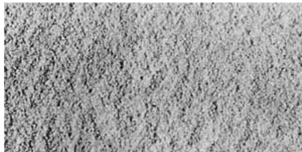
a. Fine: 100% effective - less than 60 mesh.

Fly ash is a byproduct of coal combustion. The chemical characteristics of fly ash depend on the source of the coal. Some coals have high sulfur content and can produce fly ash with low pH while others have lower sulfur content and have high calcium and magnesium contents.