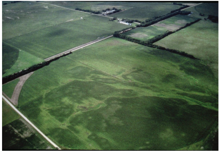
Figure 2. Iron chlorosis in soybean, western Nebraska.

gallons of water per acre and apply it directly with the seed, without adding any other fertilizer.