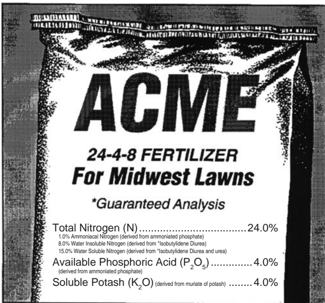
Figure 2. Sample fertilizer bag showing composition of three major nutrients (nitrogen, phosphorus and potassium).

To prevent plant injury, avoid using fertilizer-herbicide or “weed-and-feed” combinations. Herbicides should be applied separately at the rates suggested on the label. Some