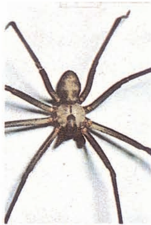
5. Brown recluse spider ( poisonous bite ) and close-up of "fiddle-shaped" marking on back