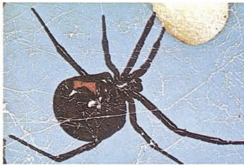
6. Black widow spider ( poisonous bite )