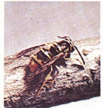
8. Yellow jacket ( stings )