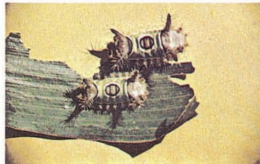
11. Saddleback caterpillar ( stinging hairs )