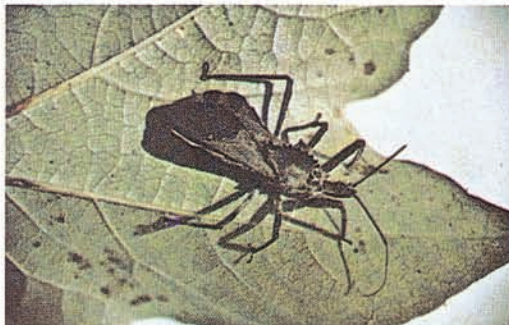
4. Wheel bug ( punctures skin )