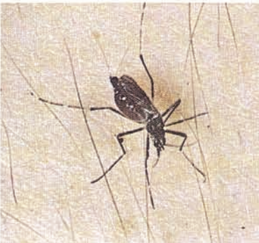
3. Mosquito ( sucks blood )