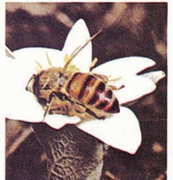
10. Honey bee ( stings )