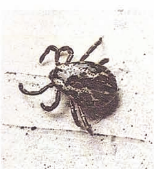
2. American dog tick ( attaches and sucks blood )