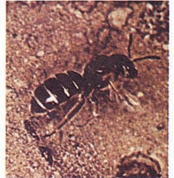
9. Sweat bee ( stings )