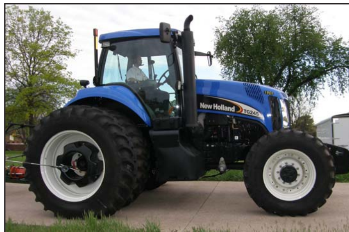
NEW HOLLAND TG245 DIESEL