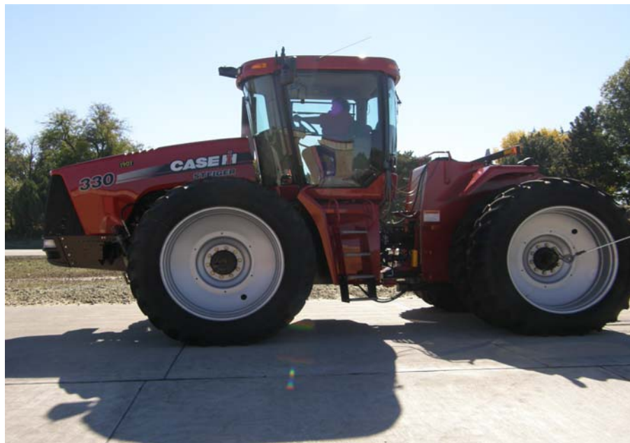
Case IH Steiger 330 Diesel