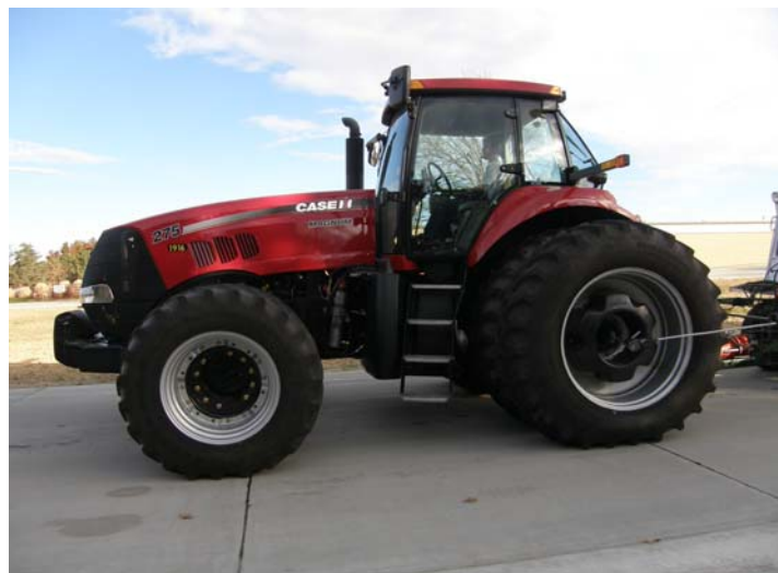
CASE IH MAGNUM 275 DIESEL