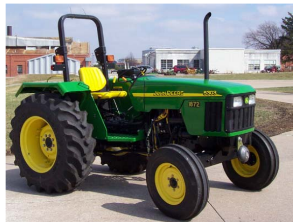
John Deere 5303 Diesel