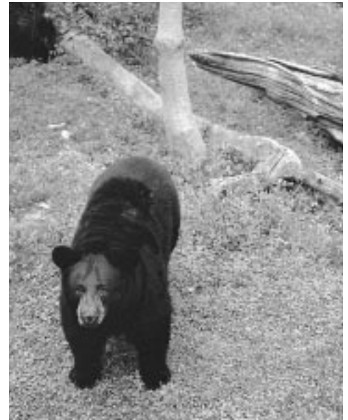
Poised for a comeback. Biologists in Louisiana may have discovered how to increase populations of native black bears.

The Service's recovery plan for the Louisiana black bear lists three criteria for full recovery and delisting: existence of at least two viable subpopulations in the bear's historic range; establishment of travel corridors between subpopulations; and protection of habitat supporting the subpopulations and travel corridors.