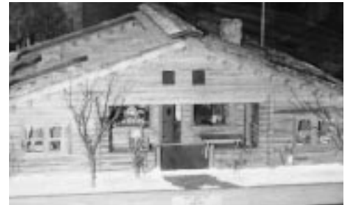
Little house. This replica of Olaus Murie's cabin is the newest addition to the Service museum.

Celebrating the Muries is an ongoing project at the National Conservation Training Center. To commemorate their contributions the training center will host a Murie Historical Workshop July 6-9, 2000, some eighty years after Olaus Murie was first offered a job as a biologist for the Bureau of Biological Survey at the salary of $1,500 a year.