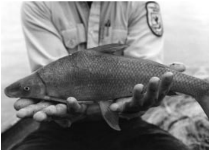
Who's got the blues? Fishery biologists from the Oklahoma Fishery Resources Office frequently net blue suckers in the Red River while surveying for other native species such as paddlefish and alligator gar. The blue sucker, a species of special concern, sporadically occurs over much of the Mississippi River drainage.