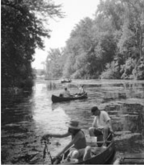
Worthy project. Service employees and volunteers removed four tons of water chestnut from the Connecticut River.

■ Ohio River Mussels Poster, Ohio River Valley Ecosystem Team —aimed at highlighting mussels, an often overlooked but important component of the Ohio River watershed. The poster will depict 40 native mussels and list their conservation status. The back of the poster will include information on mussel life cycles, anatomy and economic uses, and a bibliography.