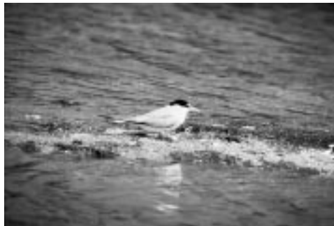
Top priority. The Area III Biologists' Committee is looking at ways to count and conserve migratory bird species such as the least tern.

However, biologists needed a standardized data collection format and a centralized data repository to show population trends. Last February, the group's Database Subcommittee discussed migratory bird