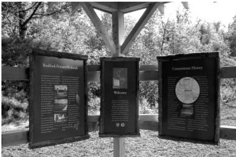
Homegrown effort. Interpretive signs welcome visitors to these newly restored wetlands in Vermont.