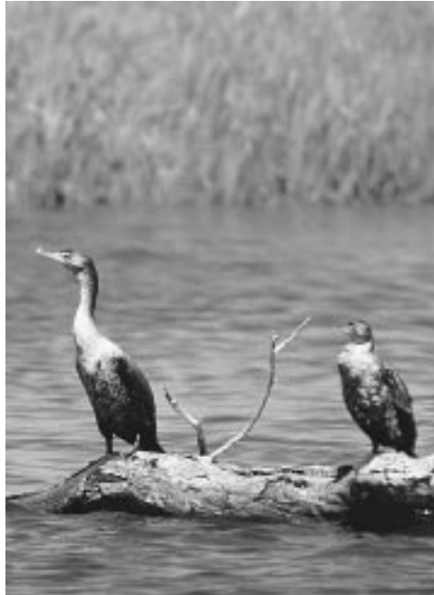
Concern. The Service will evaluate the status of cormorants, which can be destructive to fishery resources.

Populations of double-crested cormorants declined dramatically during the 1950s and 1960s from the effects of human persecution, the pesticide DDT and the overall declining health of many ecosystems, especially that of the Great Lakes. Today, the population is at historic highs, due in large part to the presence of ample food in their summer and winter ranges, federal and state protection, and reduced contaminant levels.