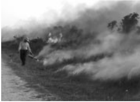
Beneficial fire. Firefighters burned nearly 10,000 acres at Aransas NWR.

The result of the team effort and support from various agency fire programs: bringing an imperiled ecosystem a little closer to its natural state and helping the recovery of a flock of whooping cranes looking to survive through another winter.