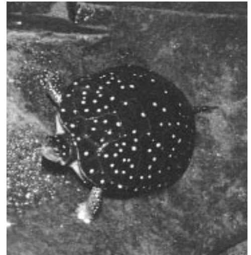
Imperiled. The spotted turtle is one of a number of species for which the United States has proposed international protection through CITES.

Sharks are more vulnerable than most other fish because of their delayed maturation, relatively low rate of reproduction and longevity. The United States is proposing the whale shark for Appendix II and the great white for Appendix I.