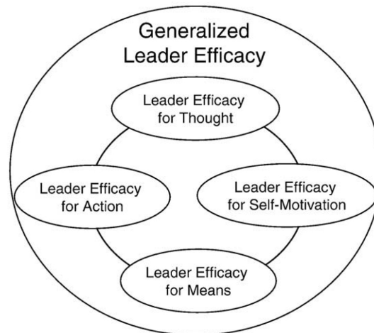
Figure 2. Hierarchical and multivariate structuring of leader efficacy.