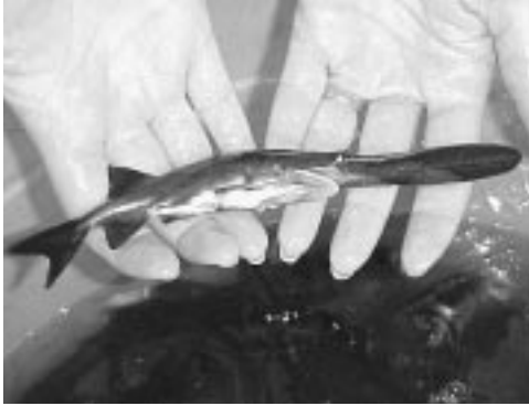
In good hands. National fish hatcheries and their partners are helping to restore paddlefish.

Successes like this one are mounting (see sidebar). Paddlefish have already been restored to waters above dams on the Verdigris and Arkansas rivers in Kansas and Oklahoma. What were twelve-inchers a few years ago now weigh more than 75 pounds and measure five feet long. In the next decade anglers can expect these new residents to reach 100 pounds.