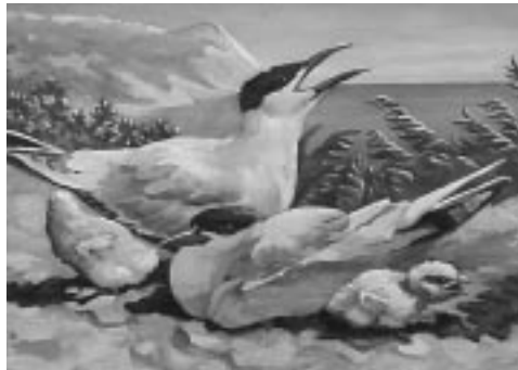
Cross-culture. One of the paintings created by students in the Ukraine and displayed at Neal Smith NWR.

The Iowa waterfowl art soon found an appreciative new audience of Ukrainian students and artists at Cherkasy Oblast Art Museum. Next, the artwork was featured as a traveling exhibit throughout Cherkasy. On May 12, the Iowa art returned home, going on display—along with the Ukrainian art—at Neal Smith NWR.