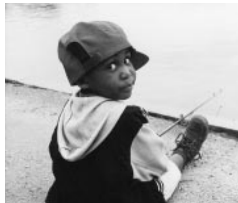
Waiting for a bite. This young angler was content to observe the scene as he cast his line and waited for a sunfish or catfish to bite.