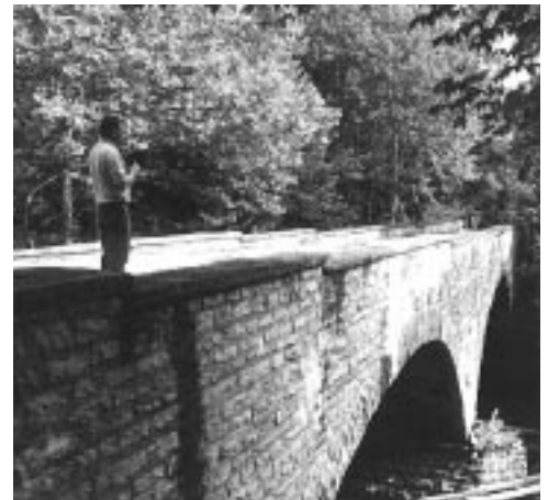
The latest addition. Big Oaks NWR represents one of a growing number of refuges located on former military grounds.

With 50,000 acres of forest, grassland and wetland habitat, Big Oaks encompasses one of the largest remaining contiguous blocks of habitat in the region. The new refuge provides managed habitat for 120 species of breeding birds, the federally endangered