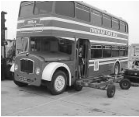
All aboard. What does this 1940s British double-decker bus have to do with conservation in the High Plains?

Ranch conversations are the first outreach efforts of a multi-agency partnership known as the High Plains Partnership for Species at Risk. The idea behind ranch conversations is to promote open dialogue with landowners about conserving habitat for the lesser prairie chicken, a candidate species for the Endangered Species list.