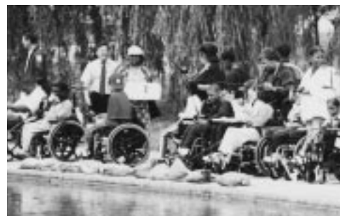
Fun for everyone. Disabled children got in on the fun of fishing, too.