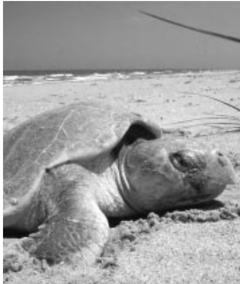
Moving up. Populations of endangered Kemp's ridley sea turtles in the Gulf of Mexico continue to climb thanks to cooperative conservation efforts between the Service and Mexico.