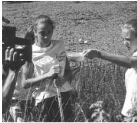
Sleuthing. Girl scouts helped Service biologists to survey a refuge pond in search of deformed frogs.

The Service launched the study during the day-long July event at Mabott Pond on Patuxent Research Refuge in Laurel, Maryland, some 45 minutes from Washington, D.C. Local volunteers and Girl Scout troops assisted biologists from the Service’s Annapolis, Maryland, ecological services field office in checking ponds on the refuge for malformed frogs. They found about a dozen frogs, although none were malformed.