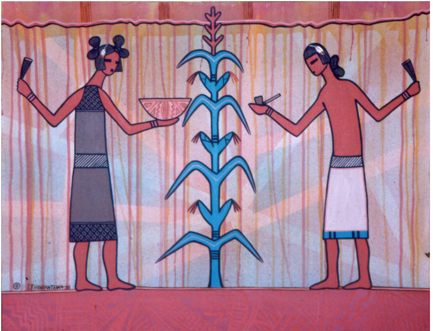
Figure 15. HARVEST PRAYER Honvantewa (Terrance Talaswaima) painting, acrylic (Courtesy of Artist Hopid, Second Mesa, Arizona)