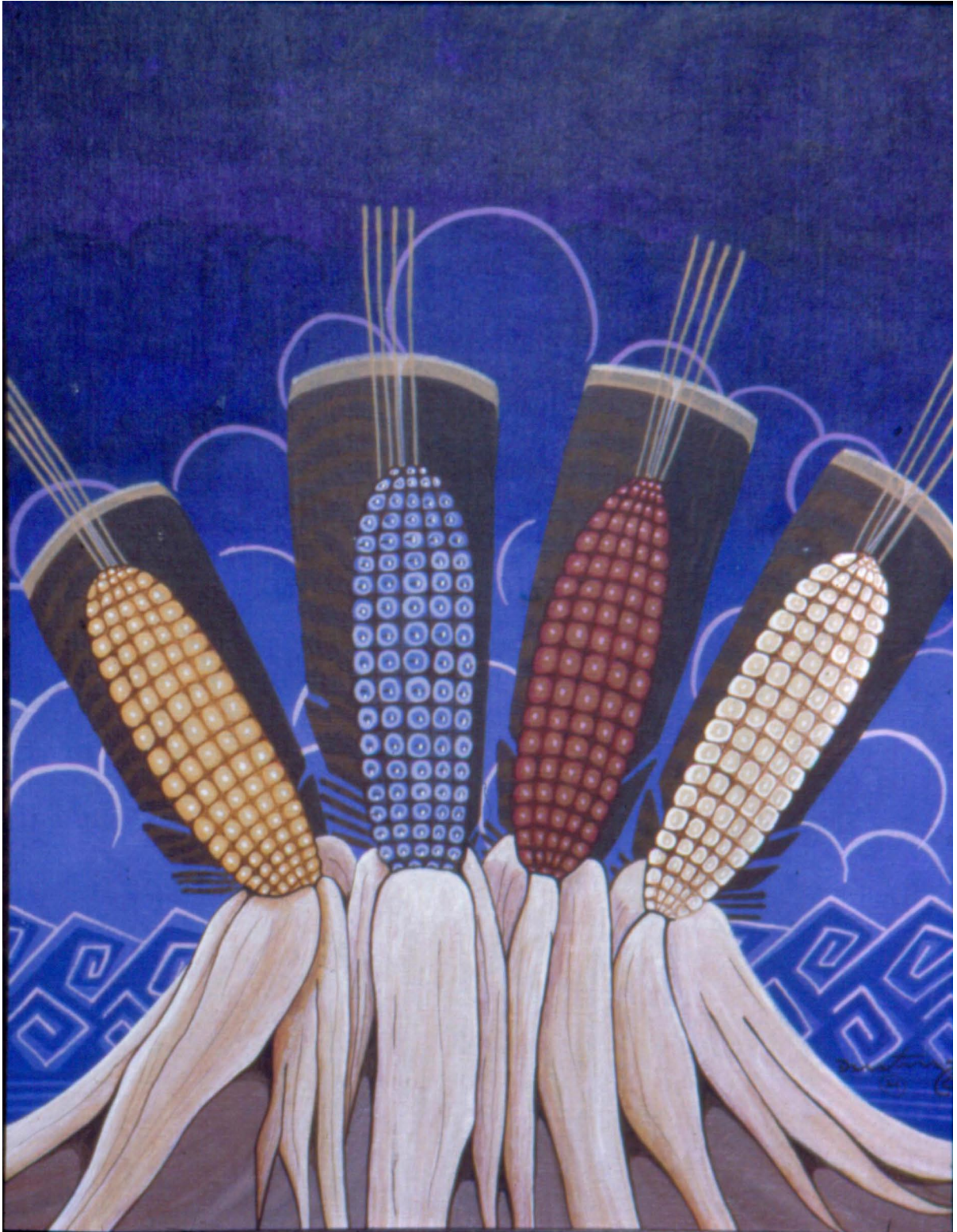
Figure 13. FOUR MOTHER CORN Dawakema (Milland Lomakema) painting, acrylic (Courtesy of Artist Hopid, Second Mesa, Arizona)