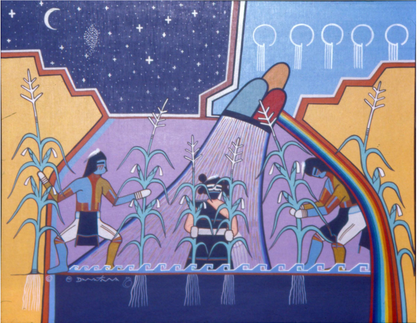
Figure 16. KACHINAS GERMINATING PLANTS Dawakema (Milland Lomakema) painting, acrylic