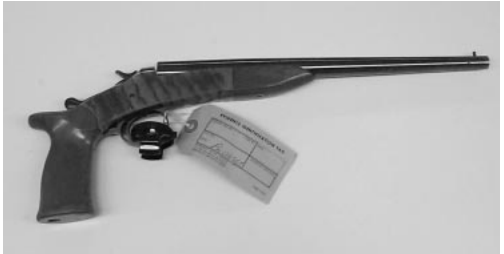
New acquisition. This vintage snake gun has a new home at the Service's museum archives.

One of the newest acquisitions at the Service's museum in Shepherdstown, West Virginia, is arguably one of the most unusual firearms ever held by a Service law enforcement agent. Transferred to the museum from the Division of Law Enforcement Training Division in Glynco, Georgia, the 17-inch snake gun is now illegal to possess. However, snake guns were once widely used to shoot... well, snakes, among other things.