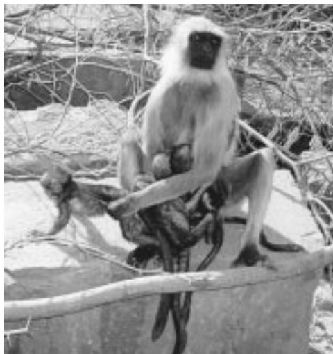
Proud mother. This Hanuman langur, one subject in a Service-University of Jodhpur cooperative study, gave birth to an unprecedented set of quadruplets in March.

In March, scientists working with the Indo-U.S. Primate Project in Jodhpur, India, reported that a Hanuman langur, a primate indigeous to that region, had given birth to quadruplets. It is believed that this is the first record of such an event in the world—either in the wild or in captivity.