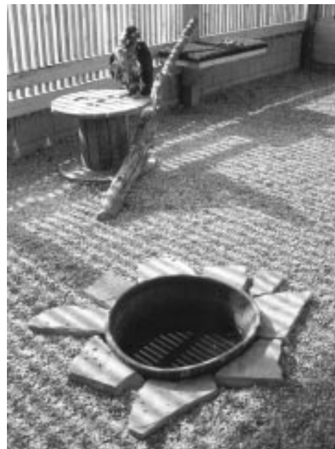
Home. A golden eagle caught in a sunbeam at the new Zuni Pueblo aviary.