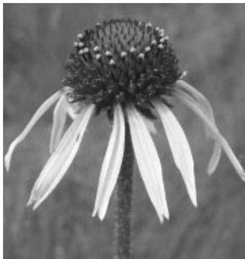
Prevention. Marketed as Echinacea , purple cone-flower is one species being targeted for conservation before it becomes scarce.

The U.S. market for medicinal herbs is worth more than $3 billion and is growing by about 20 percent per year. At least 175 species of plants native to North America are sold in the non-prescription medicinal market in the United States, and more than 140 native U.S. medicinal herbs have been documented in herbal products and medicines in foreign countries.