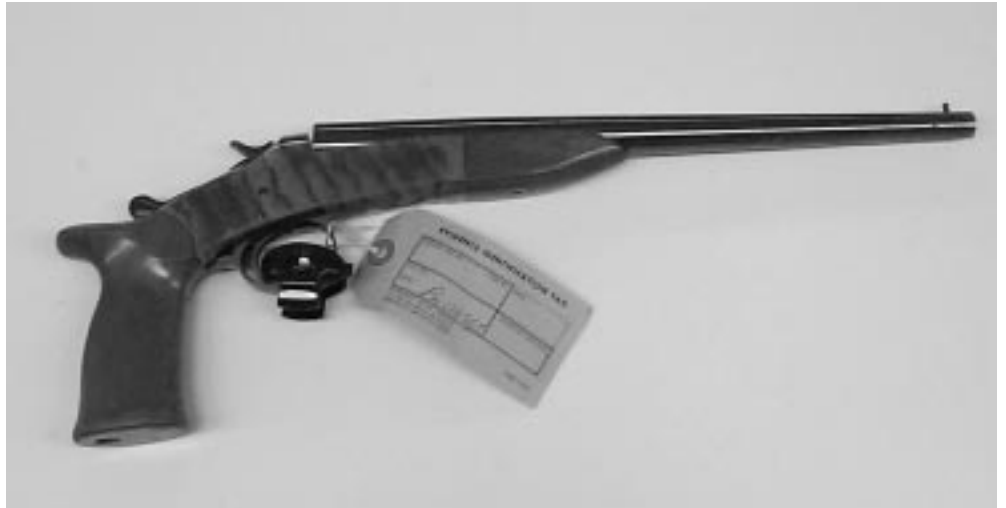
New acquisition. This vintage snake gun has a new home at the Service's museum archives.

One of the newest acquisitions at the Service's museum in Shepherdstown, West Virginia, is arguably one of the most unusual firearms ever held by a Service law enforcement agent. Transferred to the museum from the Division of Law Enforcement Training Division in Glynco, Georgia, the 17-inch snake gun is now illegal to possess. However, snake guns were once widely used to shoot... well, snakes, among other things.