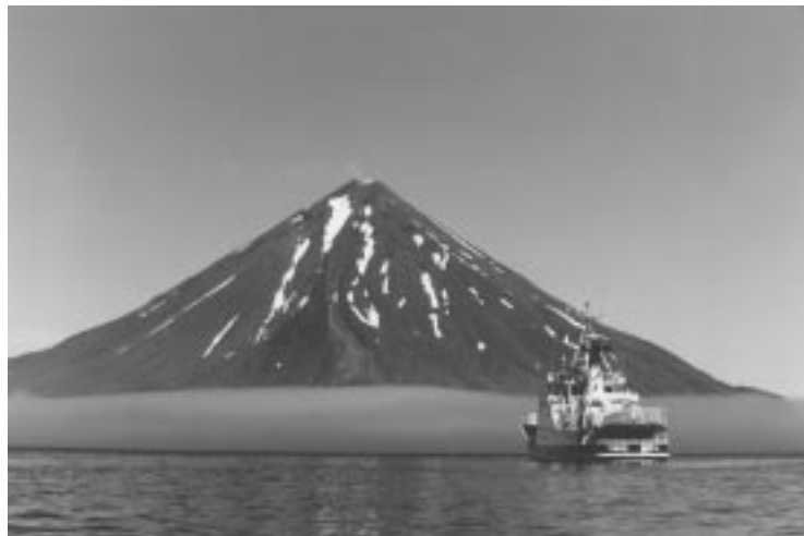
MV Tiglax at Chuginadak. Alaska