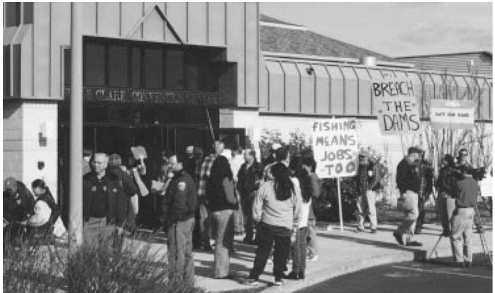
Expression. Protesters swirled around a public meeting in Clarkston, Washington, on recovering Northwest salmon.