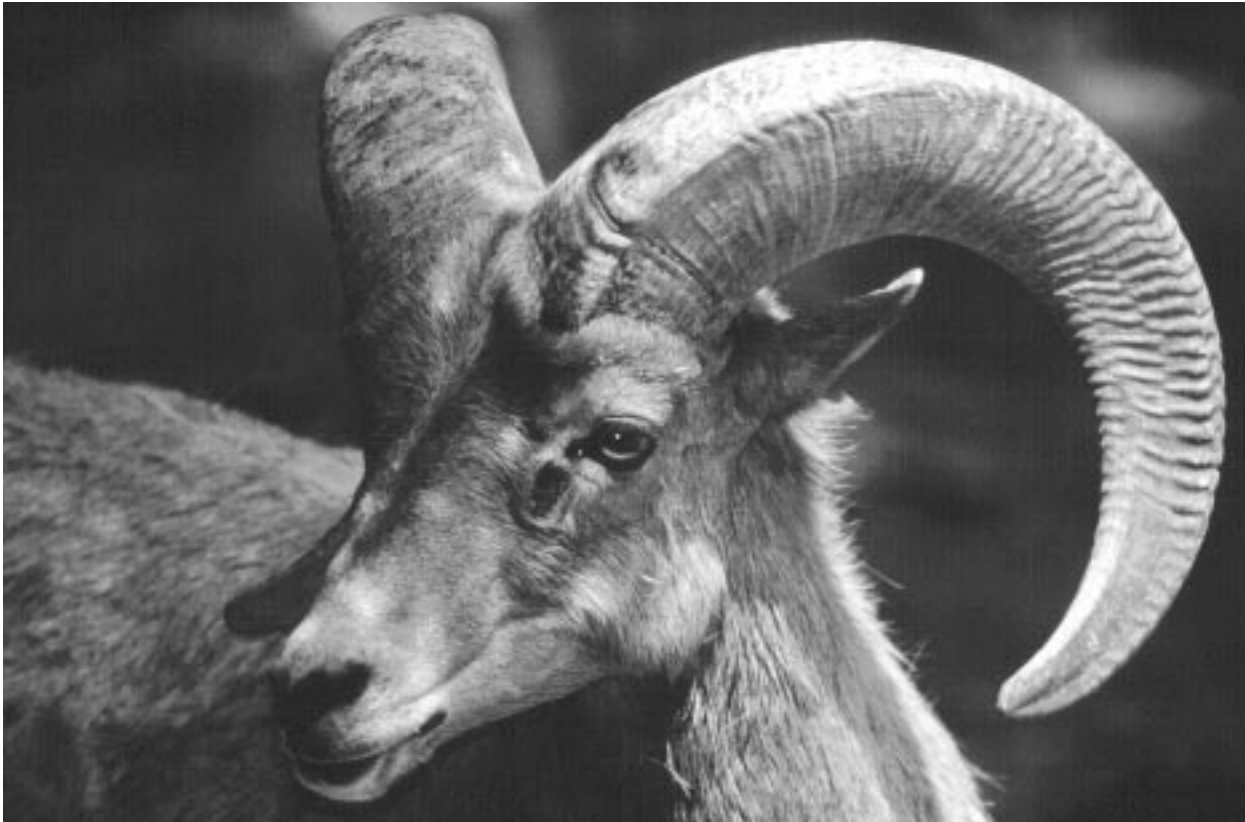
Desert bighorn sheep. Lynn B. Starnes, Fisheries, Albuquerque, New Mexico