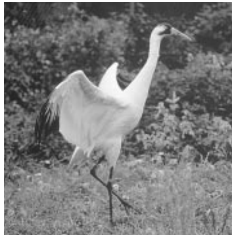
Coming along nicely. Captive bred whooping cranes—like this one at Patuxent NWR in Maryland—are part of a continuing successful effort to recover whooping cranes.

Another significant whooper group is the non-migratory flock in Florida, which currently consists of 91 birds. Since 1993, between 20 and 30 juvenile whooping cranes have been raised annually in captivity and soft-released onto the Kissimmee Prairie of central Florida. These birds are raised by handlers wearing crane costumes so that the birds remain afraid of people and learn the right behaviors to enable them to survive in the wild.