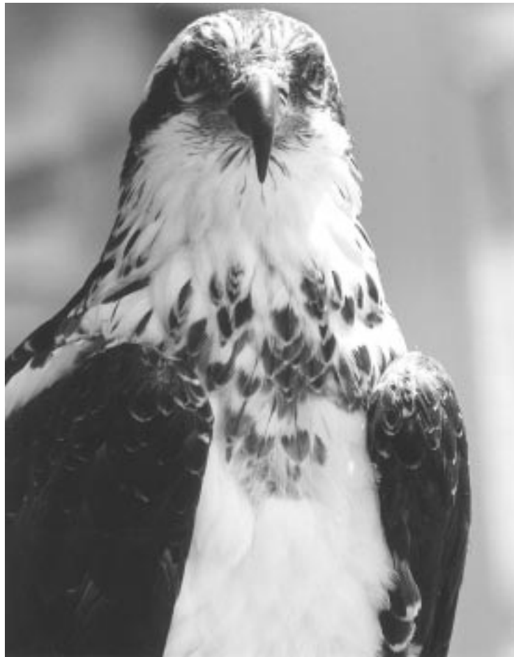
Osprey.