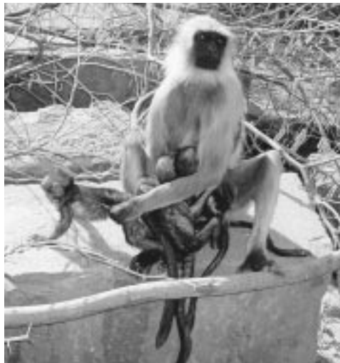
Proud mother. This Hanuman langur, one subject in a Service-University of Jodhpur cooperative study, gave birth to an unprecedented set of quadruplets in March.

In March, scientists working with the Indo-U.S. Primate Project in Jodhpur, India, reported that a Hanuman langur, a primate indigenous to that region, had given birth to quadruplets. It is believed that this is the first record of such an event in the world—either in the wild or in captivity.