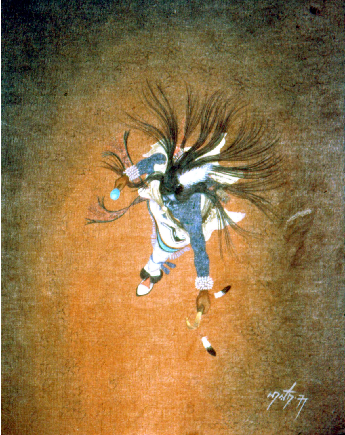
Figure 72. PUEBLO WARRIOR DANCE Neil David, Sr. painting, acrylic (Courtesy of Artist Hopid, Second Mesa, Arizona)