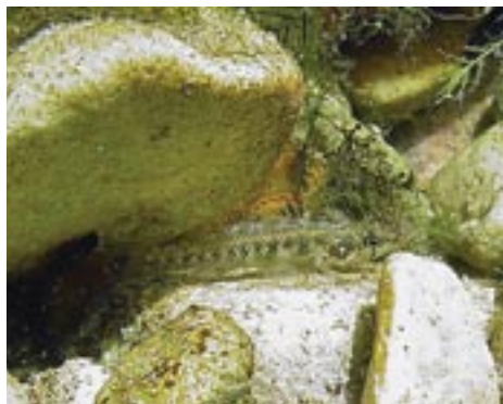
A well-camouflaged fountain darter in its Comal River habitat.

The information compiled during the last couple of years will be used to study potential methods for controlling the