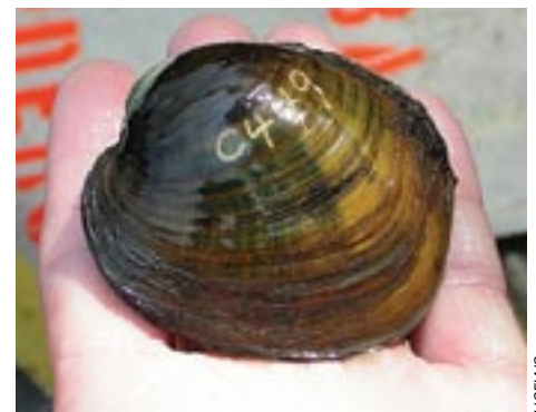
A Higgins eye pearlymussel engraved with a tracking number.