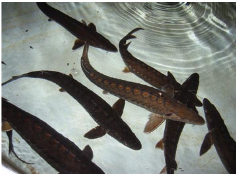
Adult shortnose sturgeon

"Early on, the experience was simply learning to keep fish alive. There's a steep