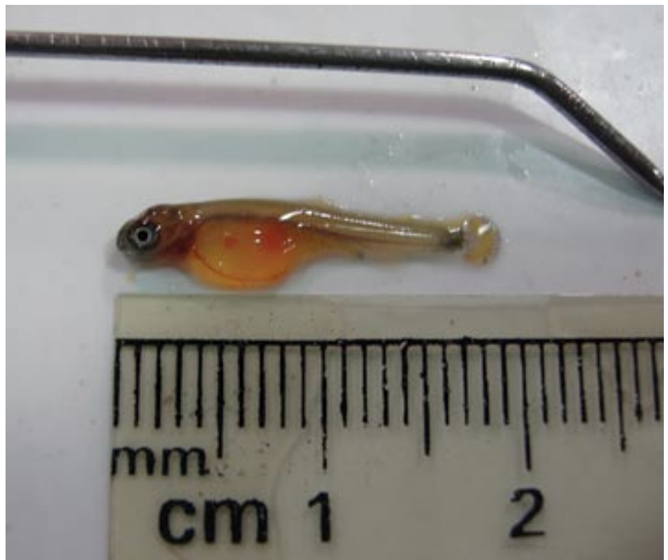
Recently hatched Snake River cutthroat trout from the Jackson National Fish Hatchery. A cooperative research project is ongoing with several agencies and Service facilities to investigate diet, temperature, and density propagation requirements for three strains of cutthroat trout and Gila trout.