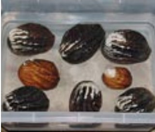
Mussels collected during a stream survey.

Native mussels may be the most endangered aquatic animals. Here in Arkansas, they were once found in great abundance within many streams. But pollution, over-harvest, impoundments, and dredging changed the character of streams and took a toll on many aquatic organisms.