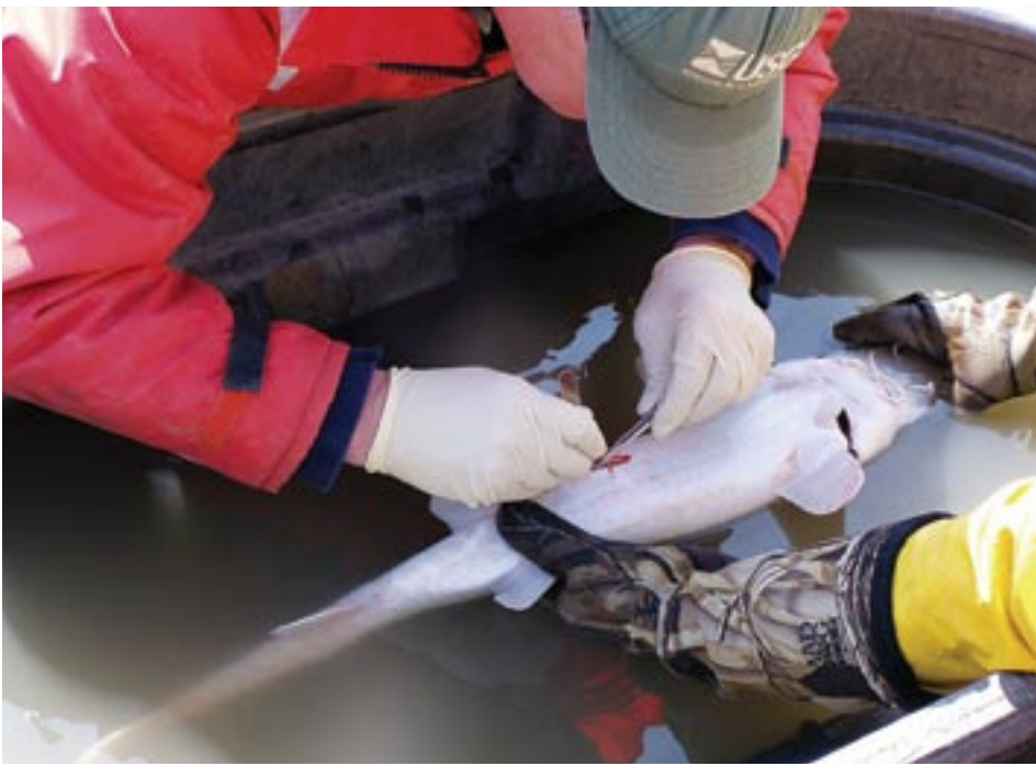
Biologists with the Service and USGS surgically implant a sonic transmitter into a pallid sturgeon for tracking research.