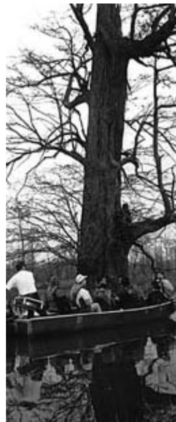
Visitors to the Cache River dedication celebration were treated to a boat tour of the cypress swamp, with a stop at this 1,000-year-old cypress tree.

- Georgia Parham Public Affairs Bloomington, Indiana