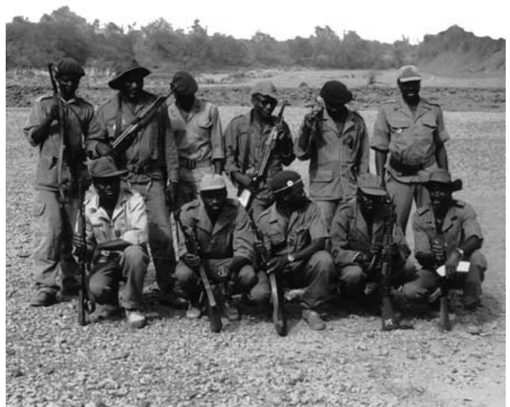
A Service grant helped equip a Senegalese anti-poaching patrol, but some news reports cited the grant as evidence the Service is anti-hunting.

FOA submitted competitive grant proposals under the Act; in fact, they were the only proposals dealing with the Senegalese elephant population.