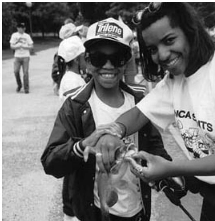
A youngster is all smiles after catching a fish at a "Pathway to Fishing" event, a program to educate children about aquatic ecosystems and to teach them to fish, at a pond near the Washington monument.