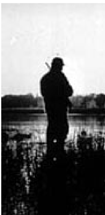
Beauty of the hunt.

In September, Federal Cartridge Company filed an application with the Service for approval of tungsten-iron shot. The Service currently is considering that application.