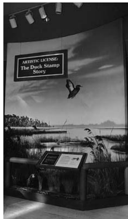
The exhibit, "Artistic License: The Duck Stamp Story," opened at the National Postal Museum this summer.