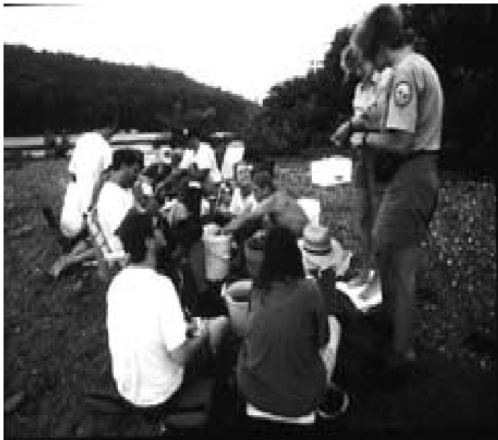
The Ohio Valley Ecosystem team, assisted by volunteers, prepares 3,000 freshwater mussels collected from the river for relocation to a quarantine facility.