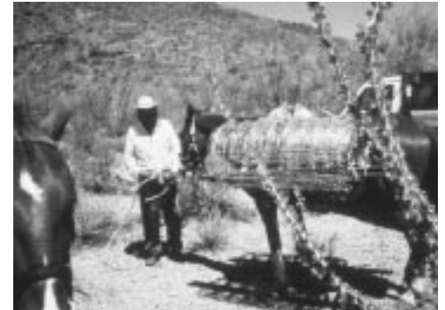
All together now. A Tohono O’odham tribe member packs fencing material up a mountain to the project area.