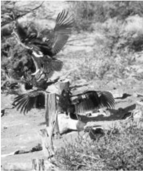
Majestic symbol. Condor feathers are distributed by permit to Indian people for religious and ceremonial purposes.

The condor's importance to Indian people has been chronicled in oral legends, ceremonies, dances and rock paintings. The sixty major tribes in California have more than 65 known names for condor, including Moloko, Almiyi, Hol-Hol and Wit. The Tolowa of the northern California coast call Condor "Te-long-yi-chah," which means "whale lifter." The first recorded condor sighting by a European was made by a Jesuit priest in 1602 when he saw a condor feeding on a whale carcass with some grizzly bears.