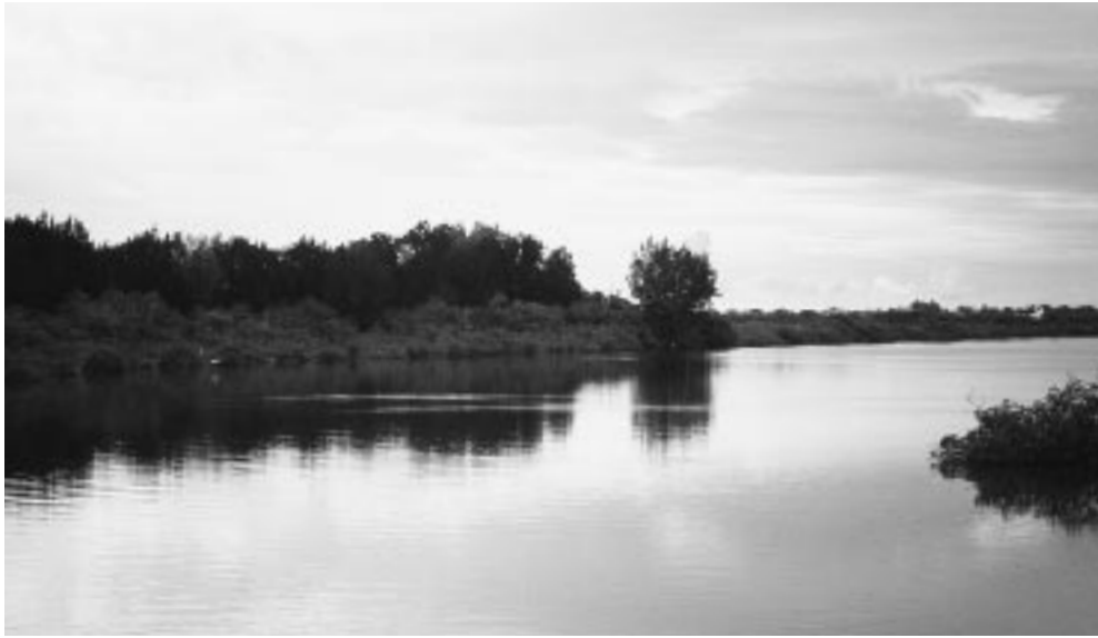
The beginning of it all. Tiny Pelican Island was the first national wildlife refuge, established in 1903. Now photographers have hundreds of refuges to choose from to capture beautiful habitat and wild creatures on film.

For the National Wildlife Refuge System the year 2003 marks not only the end of the first century of this unique network of lands and waters, but the beginning of a new century full of potential. A special edition National Wildlife Refuge System calendar is just one of the many ways the Service will mark the Centennial. The calendar will be devoted to sharing with the American public glimpses of the beauty and diversity of refuges and the wildlife and people who enjoy them.