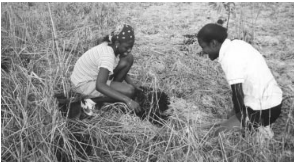
Working together. Volunteers planted more than 7,000 cypress tree saplings at Loxahatchee NWR.

The endangered snail kite soars over the remnant cypress swamp in the heart of the Arthur R. Marshall Loxahatchee National Wildlife Refuge. From a canoe paddling through the canals and wet prairie of the refuge, you can see alligators basking in the sun and hear roosting wood storks calling from the brush tree islands.