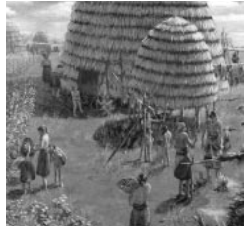
Long ago. A depiction of a Caddo Tribal village located near the present-day site of Natchitoches National Fish Hatchery in Louisiana.

In the 19th century the Caddo region became disputed territory between France and Spain, and later between Spain and the United States. With the advance of the French, Spanish, and American nations came