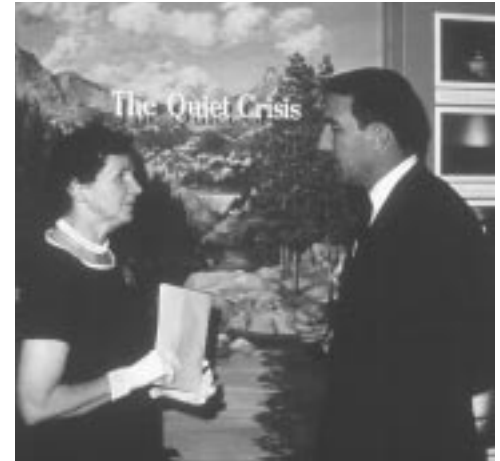
Visionary. Rachel Carson with Interior Secretary Udall at a 1962 White House conference.