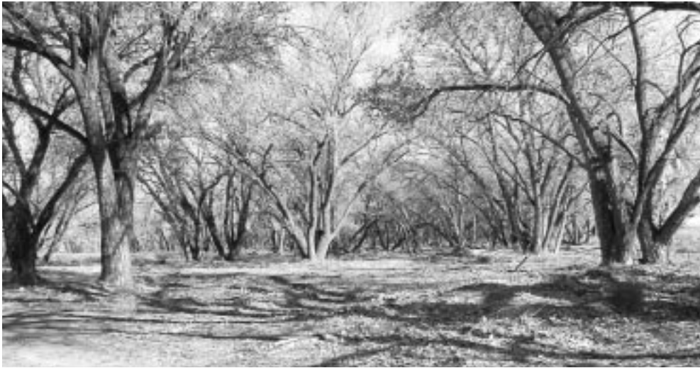
Rejuvenated. Cottonwood trees in the restored area of the Santa Ana Pueblo Bosque.