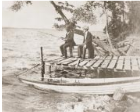
Passing the time. Horicon Marsh was a legendary hunting and fishing area between 1846 and 1869, as shown in this image from the Horicon NWR archives.

The dam was removed in 1869 and natural water levels returned. By then, the area was already famous for duck hunting at a time when no hunting laws existed. Over the next