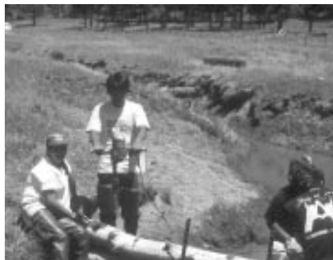
Restoration. Native American partners work with the Fish and Wildlife Service at Finger Island, in Arizona, removing debris that has altered a stream's natural channels.

Native American governments in the United States co-manage some of the nation's most important fish and wildlife, and the protection of these tribal trust resources remains a critical element of Fish and Wildlife Service policy.