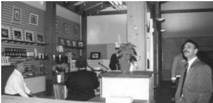
New gathering place. A new environmental education center at John Heinz Refuge features a gift shop run by the Friends of John Heinz NWR at Tinicum.

Urban national wildlife refuges preserve some of the most important tracts of undeveloped lands in the nation's large cities. To succeed, they need community support and innovative thinking.