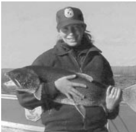
Important resource. The Service works closely with tribes and private groups to conserve lake trout.

Lake trout rehabilitation is at the heart of the new decree. Biologists believe that by reducing factors affecting mortality—such as fishing and sea lamprey predation—trout in lakes Huron and Michigan will reproduce naturally. To that end, the decree reclassifies rehabilitation zones to protect historic spawning sites and promote sea lamprey control, increase lake trout abundance, and provide more fish for all users.