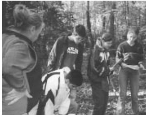
In the field. Thomas Jefferson High School students survey study plots and take soil samples at Mason Neck NWR as part of a yearlong class project on wetlands.