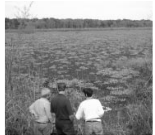
It's not a field. Ducks fly over it and mammals drown trying to walk on it.

Only the whirr of wasp wings buzzing broke the silence. Still air emphasized the lack of waterfowl on the small southern Texas lake that in early Spring should have teemed with teal, dabblers and divers making their way back north.