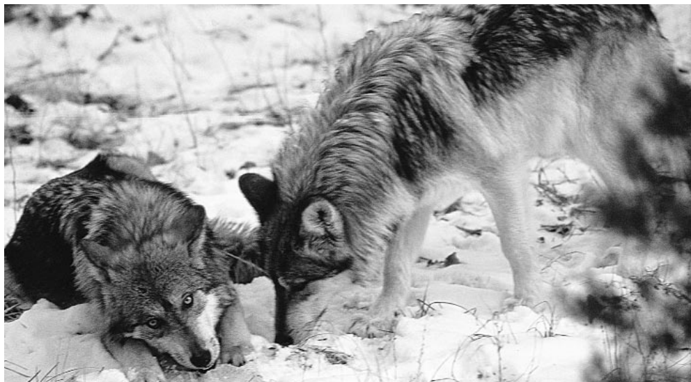
New partner. Mexican wolves are welcome on White Mountain Apache lands.

The Service recently welcomed the White Mountain Apache Tribe to its list of partners involved in Mexican wolf recovery. Other partners in the three-year-old effort include the Arizona and New Mexico game and fish departments, the U.S. Department of Agriculture's Wildlife Services division, and the private Turner Endangered Species Fund.