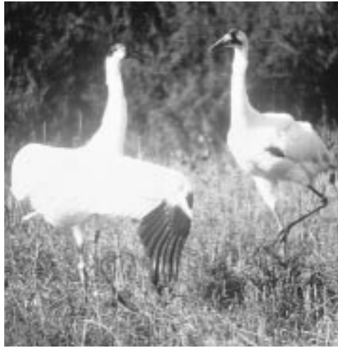
Do a little dance. Yearling whooping cranes pose at Patuxent Wildlife Research Center.

A second non-migratory flock lives year round in central Florida, as part of a separate and ongoing reintroduction effort.