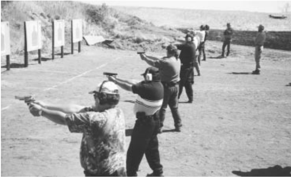
In training. Native American wildlife law enforcement officers practice firearms skills during Service training at Fort Yates, North Dakota.