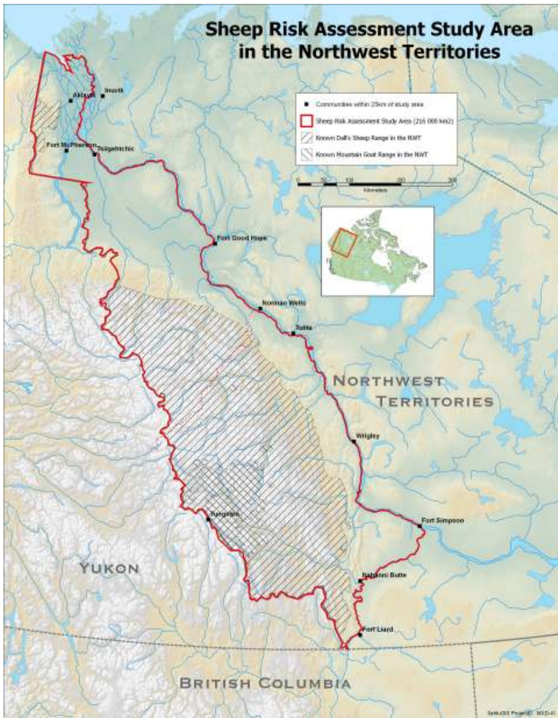
Figure 1. Map showing region of Northwest Territories covered by risk assessment.