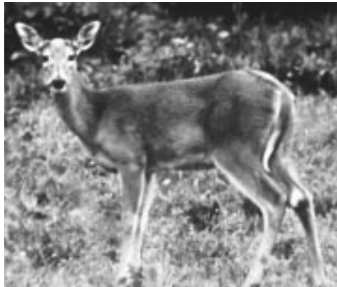
Columbian white-tailed deer.

The Service removed the American peregrine falcon from the list of endangered and threatened species in August 1999, marking one of the most dramatic success stories of the Endangered Species Act. DDT decimated the population, causing peregrines to lay thin-shelled eggs that broke during incubation. Service researchers confirmed the link between DDT and egg shell thinning on peregrines in the United States, and Rachel Carson, a former Service employee, helped alert the public to the hazards of pesticides on wildlife in her 1962 book, Silent Spring . Ten years later, the Environmental Protection Agency made the historic and, at the time, controversial decision to ban DDT in the United States, the first step on the road to recovery for the