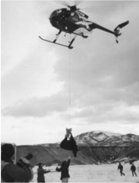
Easy does it. A helicopter gently lowers one of 20 shiras moose to the ground during a successful cooperative relocation effort in Utah.

Male shiras moose, the smallest of three subspecies, and found throughout the intermountain West, grow to be 800 to 1,000 pounds. Adult shiras cows weigh 600 to 800 pounds.