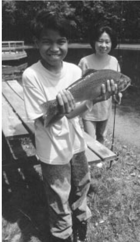
All can take part. With a new strategic plan, the Recreational Boating and Fishing Foundation hopes to draw more people to boating and fishing activities.

Composed of members from several academic institutions and industry associations, this task force will identify target market segments and suggest ways to deliver to these audiences the national outreach campaign developed by Task Force One.