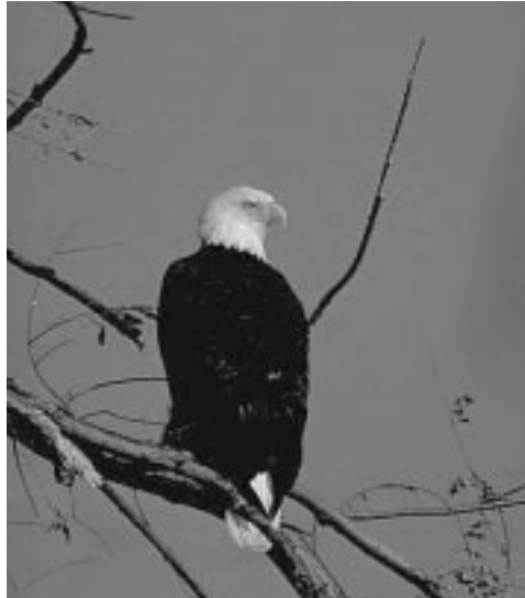
Bald eagle.

In Fiscal Year 2000, Federal Aid expects to make available to the states and territories $193 million in Wildlife Restoration grant funds and $240 million in Sport Fish Restoration grant funds.