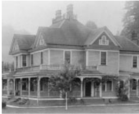
(Left) Erwin National Fish Hatchery at the turn of the century. (Right) Today's Erwin National Fish Hatchery.