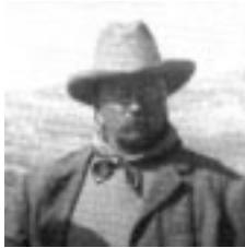
Theodore Roosevelt (1858-1919)

"Is there any law that will prevent me from declaring Pelican Island a Federal Bird Reservation?"...So inquired President