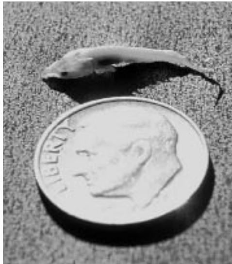
Destined for greatness. Tiny pallid sturgeon specimens like this one, the first found in the Missouri River in decades, may grow to be six feet long and weigh more than 100 pounds.

Aside from the sturgeon’s importance as a natural inhabitant of the Missouri and Mississippi river systems, the pallid sturgeon has economic benefits as some anglers consider it one of America’s premier gamefish. Eventual full recovery could mean that the sturgeon would be considered for removal from the endangered species list and would again be available to sportfishing enthusiasts.