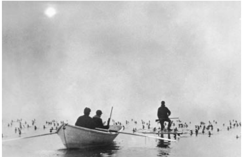
Then. Market hunting for waterfowl—for food or feathers—caused serious declines in bird populations. Market hunters were a target of the first Service wildlife inspectors.

Amendments in 1981 overhauled the original act, reworking nearly all of its major provisions and incorporating protections for fish addressed previously under the 1926 Black Bass Act. Changes included a broader definition of wildlife; safeguards for plants; and the adoption of a felony punishment scheme for certain trafficking offenses.