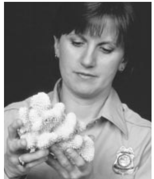
And now. Today Service Law Enforcement personnel work with diverse issues, including enforcing laws regarding smuggling of species such as coral.