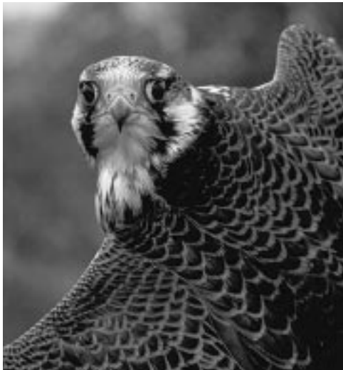
Peregrine falcon.

in partnership with other federal agencies, tribes, state and local governments, conservation organizations, universities, corporations and thousands of individual Americans, an estimated 5,748 nesting pairs live in the lower 48 states. Endangered Species Act listing provided the springboard for the Service and its partners to accelerate the pace of recovery through captive breeding programs, reintroduction efforts, law enforcement and the protection of nest sites during the breeding season.