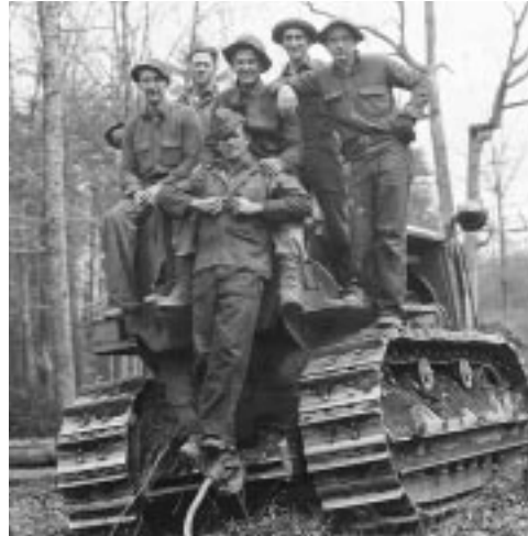
Successful effort. By the time the Civilian Conservation Corps was terminated in 1942, 4,500 camps had been established employing over 3.4 million men in a military lifestyle—an excellent source of personnel for the Army during World War II.

By 1942, 53 national wildlife refuges had benefitted directly from corps work centered on constructing dams and dikes, planting vegetation and millions of trees, stabilizing