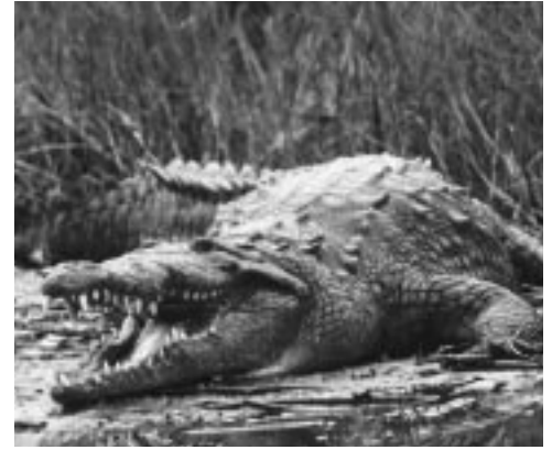
American alligator.

By the early 1960s our national symbol—the bald eagle—was heralding the environmental hazards of pesticides such as DDT. Populations of the majestic eagle declined to a mere 417 nesting birds from an estimated 75,000 ranging across the country at the time of the first European settlers. Peregrine falcons and other raptors, also in decline, echoed the eagle's call to clean up the environment and in 1972 the Environmental Protection Agency banned DDT.