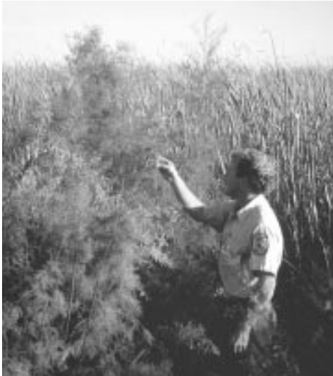
Unwanted. Invasive species such as salt cedar can decrease biodiversity, reduce water quality, contribute to soil erosion and have numerous other harmful effects on native wildlife and their habitat.

On the edge of the Grand Canyon, the Hualapai Tribal Council and the endangered southwestern willow flycatcher have the same problem: native plant communities are being overrun by a tenacious exotic tree called salt cedar.