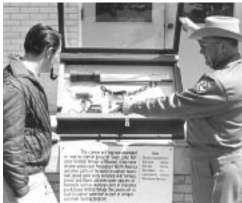
Ingenuity. Biologists examine a cannon net at Chincoteague NWR, one of many items invented by Service employees over the years.