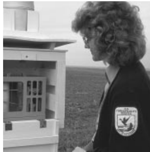
You’ve come a long way. Today’s Service patch has its origins in a patch designed in 1950 for law enforcement agents in Alaska.

When the Service was reorganized in 1956 and divided into two bureaus, rockers were added to the patch. The first rocker was worn above the patch and read “Bureau of Sport Fisheries and Wildlife.” The rockers were eliminated in 1974. A one-and-a-half-inch round patch, white and blue with a yellow border, was also used until the patch changed again.