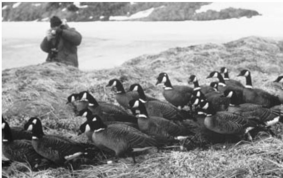
Aleutian Canada geese.