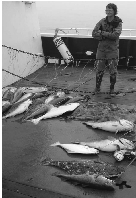
A longline is used to sample large predatory fish.

What a privilege it was to see such richness and abundance. It reminded me of the obligation we all have to ensure that unique and irreplaceable ecosystems like this remain that way.