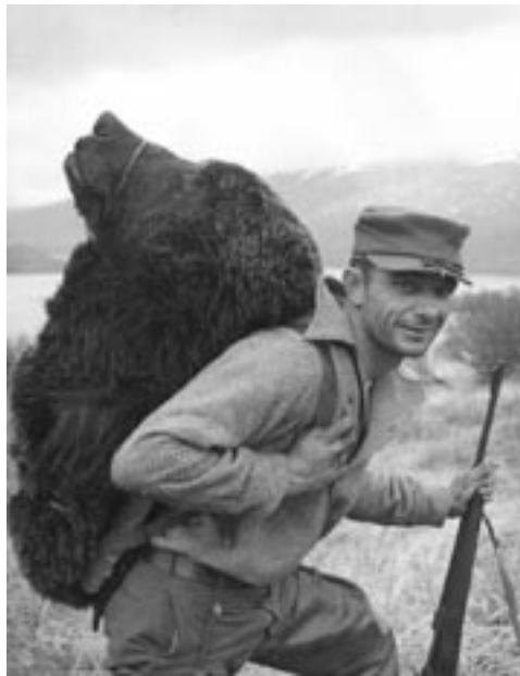
Bear hunter on Kodiak National Wildlife Refuge, May 1957. Because of its dramatic population decline, the grizzly was listed as a threatened species under the Endangered Species Act in 1975.

Fact sheets, hunter safety classes and other educational tools were created to teach hunters and outdoor enthusiasts to recognize the signs of a grizzly, how to hunt elk and black bears safely in grizzly country, prevent surprise encounters with grizzlies and protective measures to take if a bear encounter is unavoidable.