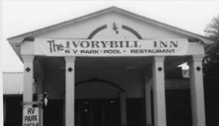
The Ivory Bill Inn in Brinkley, Arkansas.

Other wild animals inhabiting the Big Woods include black bears, white-tailed deer,