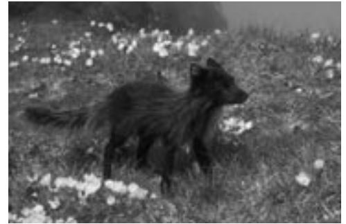
An Arctic Fox on St. George Island.

The M/V Tiglax (TEKH-lah: Aleut word for eagle) and its crew work for the Alaska Maritime National Wildlife Refuge as its research and transportation support vessel. In a season, the Tiglax may sail to islands in Southeast Alaska, the far western end of the Aleutian Chain, and into the Bering Sea. SMMOCI and the Pribilof work is an example of an ecosystem approach to conservation with the partners from USGS, the Institute of Marine Sciences, the National Marine Fisheries Service, and several universities.