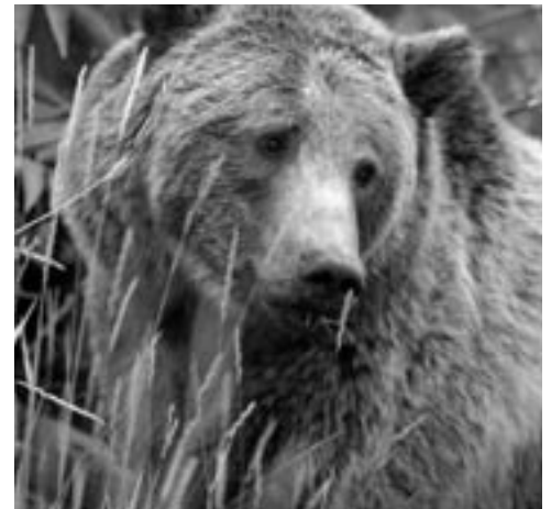
Today there are roughly 600 bears in or around Yellowstone National Park, an extraordinary recovery from the original population of about 200.

Today, there are roughly 600 bears in or around Yellowstone National Park, an extraordinary recovery from the original population of about 200. Bears have increased so prolifically in both population size and distribution that they exceeded the