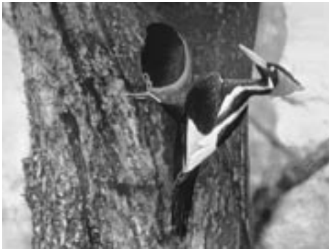
Illustration of the ivory-billed woodpecker.

With the arrival of more than 100 volunteer searchers, the 2005–06 Ivory-billed Woodpecker Research Project is fully staffed and moving forward.