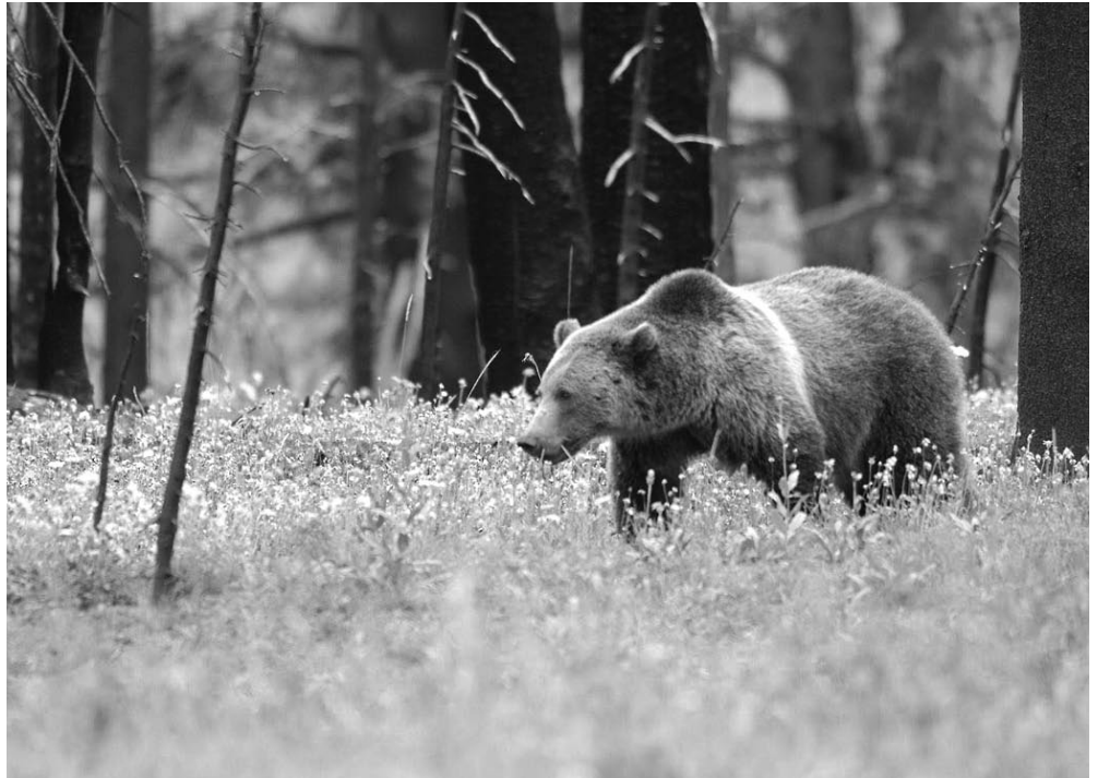
A grizzly forages for food in Yellowstone National Park.

Native Americans called them “humans without fire” because of the way they stood on their hind legs and walked upright. In fact, some Native American cultures consider them the first humans, ancestors of all tribes. Lewis and Clark boasted of their triumphs hunting them, calling them the most ferocious beasts to traverse the western United States. And Aldo Leopold declared society’s need to pave the West in the name of modern progress as thoughtless and shortsighted, ignorant as it was of how we might need “them” someday as much as we do roads and buildings.