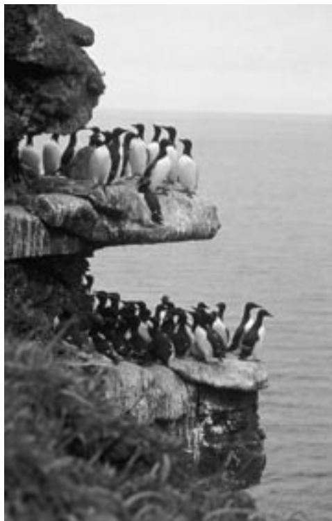
Murres on sea cliffs in the Pribilof Islands.