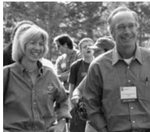
Former Interior Secretary Gale Norton and Governor Dirk Kempthorne.

“With your support and leadership, your team at Interior has accomplished great work in the face of hurricanes, record-setting wildfires and droughts, acrimonious litigation, and expanded post 9-11 security responsibilities,” the letter reads in part. “The Interior Department has conserved millions of acres of public and private lands and steered the nation toward cooperative conservation by working with landowners and local groups.”