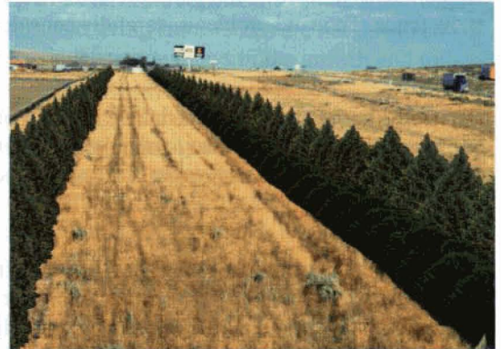
Photo on left: Trees and shrubs 2 years old. Photo on right: Trees and shrubs 20 years from now.

"The Most Dangerous Freeway in America" is how USDA Today described the 41-mile stretch of Interstate 84 that runs from near Burley, Idaho, southeast to Salt Lake City, Utah. When the wind blows, snow and dust can cut drivers' visibility to zero. A local task force studied the problem and decided to test a living snow fence on a 2.5-mile section of the highway.