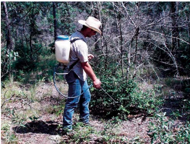
Figure 3. Yaupon being treated with basal herbicide applications 18 months after burning. The plant was top-killed by burning and sprouted from the base, resulting in numerous stems per plant.