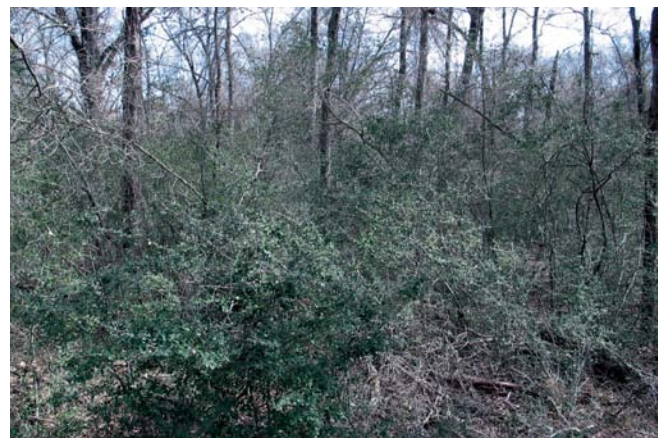
Figure 1. A dense yaupon thicket during winter at the Gus Engling Wildlife Management Area near Palestine, Texas. Some yaupon in this thicket exceeded heights of 15 feet.

Studies were conducted on the Gus Engling Wildlife Management Area (WMA) near Palestine, Texas (Fig. 2).