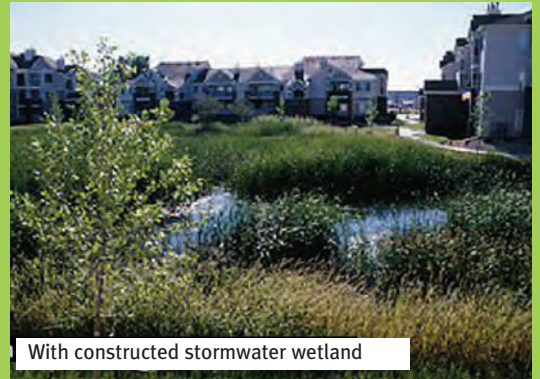
With constructed stormwater wetland

A visual-impact analysis tool for public meetings and documents.