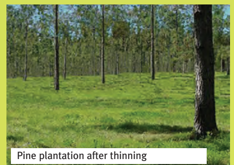
Pine plantation after thinning