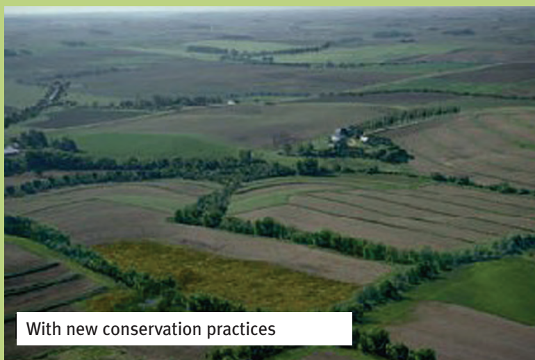
With new conservation practices