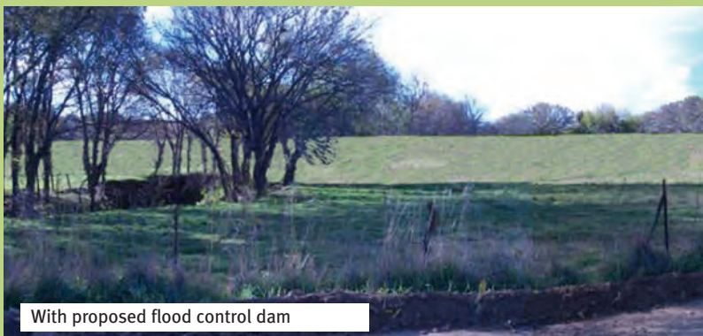
With proposed flood control dam

A training aid to help convey management concepts.