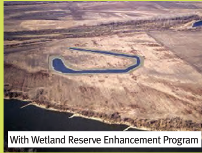
With Wetland Reserve Enhancement Program

An informational tool to illustrate conservation programs and activities.