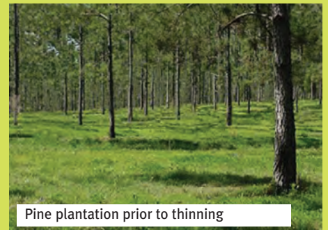
Pine plantation prior to thinning

A training aid to help convey management concepts.