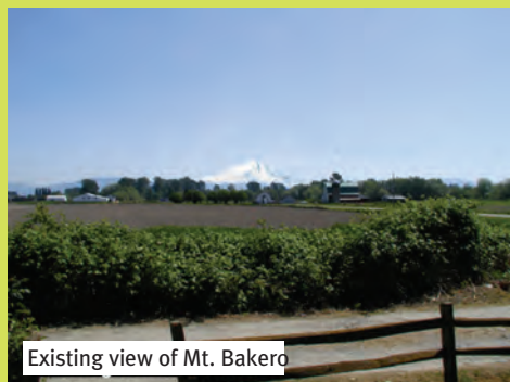
Existing view of Mt. Baker

A planning tool to present alternatives and solicit feedback.