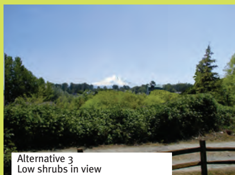
Alternative 3 Low shrubs in view