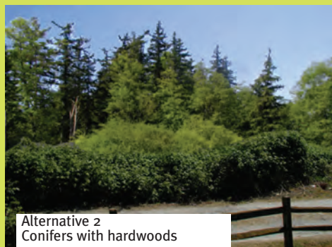
Alternative 2 Conifers with hardwoods