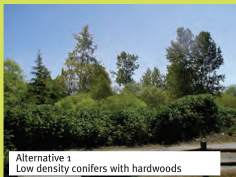
Alternative 1 Low density conifers with hardwoods