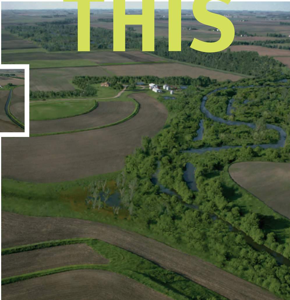
A visual simulation of a proposed stream corridor restoration project.