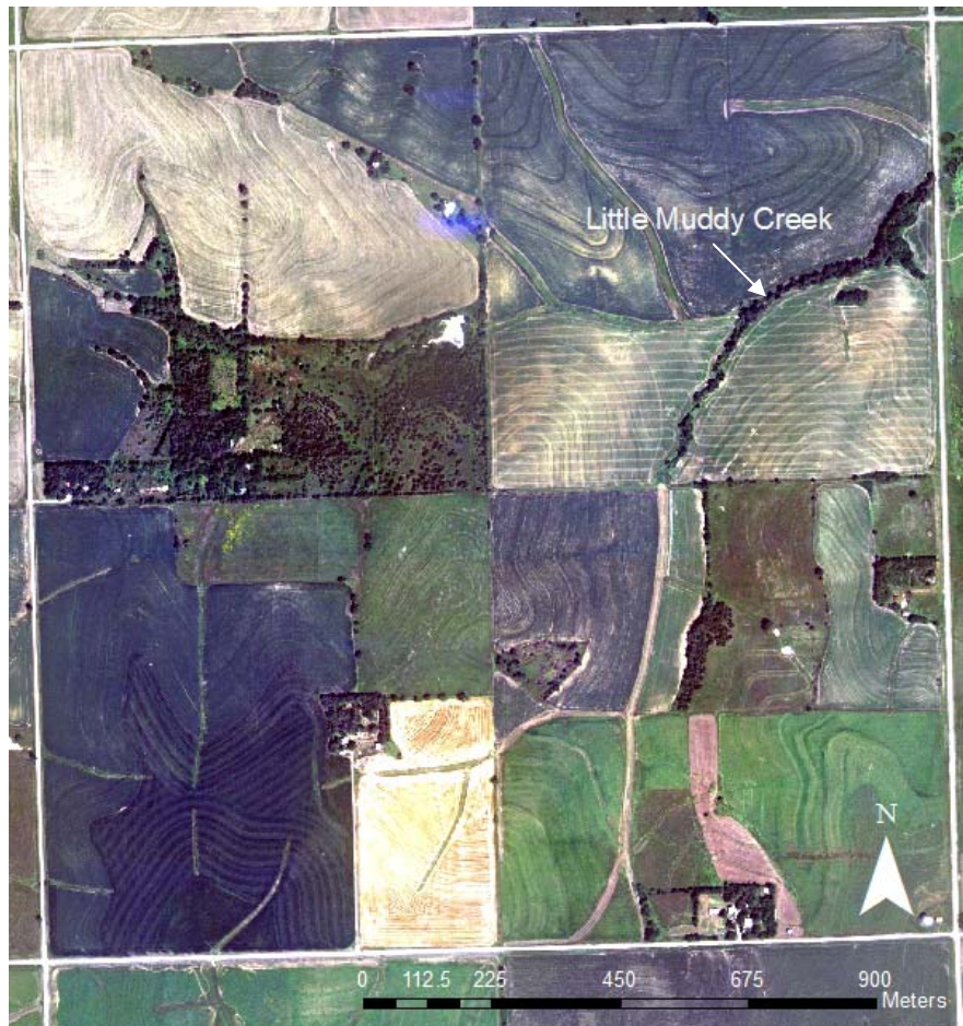
Figure 1. Aerial photograph showing the extent of terracing on one section (256 ha) which encompasses most of the Little Muddy Creek upper watershed area.