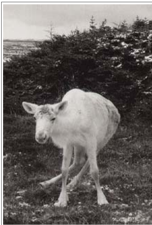
A severely infected caribou

This worm goes through different stages of development from an egg to a number of larval (immature) stages until it finally becomes the adult worm. To complete this life cycle the worm must live in two different hosts. The final host is the animal that contains the adult worm or egg laying part of the worm's life cycle. The intermediate host is the animal that contains one or more of the larval stages of the worm. For brain worm, the caribou is the final host and the intermediate hosts are snails and slugs.