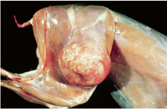
Figure 3: Taenia serialis cysts in leg muscles

The hare gets infected by eating plants that have eggs on them that came from infected final hosts. The Taenia pisiformis larvae migrate through the liver before developing cysts in the body cavity (see Figure 2). These cysts are about the size and shape of a pea, contain clear fluid and can be seen on the body's organs (such as kidney and liver). Taenia serialis larval cysts (Figure 3) develop under the skin or between the muscles of the leg.