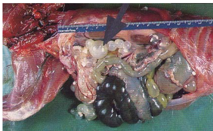
Figure 2: Taenia pisiformis cysts in body cavity

Copies of this and other publications may be obtained from the Department's Regional Offices, the factsheet author or by visiting our website at http://www.gov.nl.ca/agric/ .