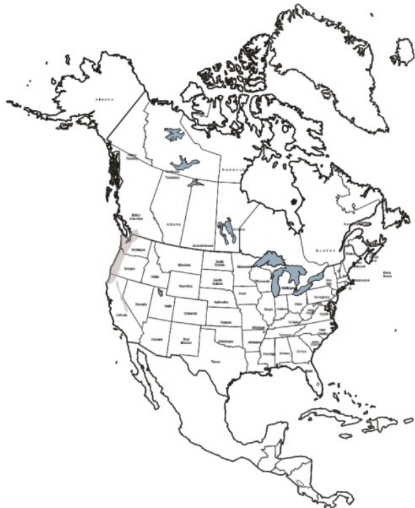
Figure 3. Distribution of the mountain beaver ( Aplodontia rufa ).

Although current damage figures are unknown, in a 1977 survey, over 111 thousand hectares of primarily Douglas-fir ( Pseudotsuga menziesii ) stands were reported damaged by mountain beaver in northern California, Oregon, and Washington (Borrecco et al. 1979, Borrecco and Anderson 1980). Western red cedar ( Thuja plicata ), western hemlock ( Tsuga heterophylla ), and Sitka spruce ( Picea sitchensis ) may also incur mountain beaver damage to a lesser extent. Seedling damage is the most prevalent up to 3 months after planting when little other available forage occurs in the harvested areas (Arjo and Nolte 2006).