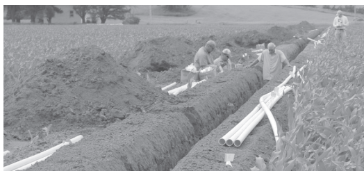
Subsurface drip irrigation being installed at the West Central Research and Extension Center.

SDI delivers water to the crop root zone drop by drop through plastic