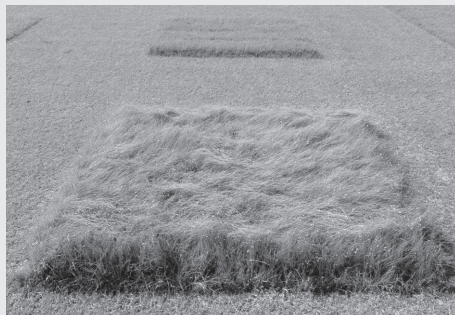
Buffalograss test plots at the Agricultural Research and Development Center near Mead.

IANR turf scientists were among the first to examine buffalograsses' turf potential. Before Nebraska's research began in 1984, turf nationwide research focused on non-native grasses; buffalograss was primarily considered pasture grass. Today, UNL is the nation's leader in turf buffalograss research.