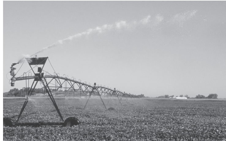
The Water Optimizer, a decision-support computer program, developed by IANR researchers, helps farmers sort out how best to use their irrigation water.

Growers load information such as the amount of water available, soil type, irrigation system type and fuel type for