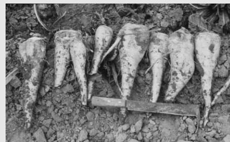
Chicory roots are now processed at the nation's first chicory processing plant.