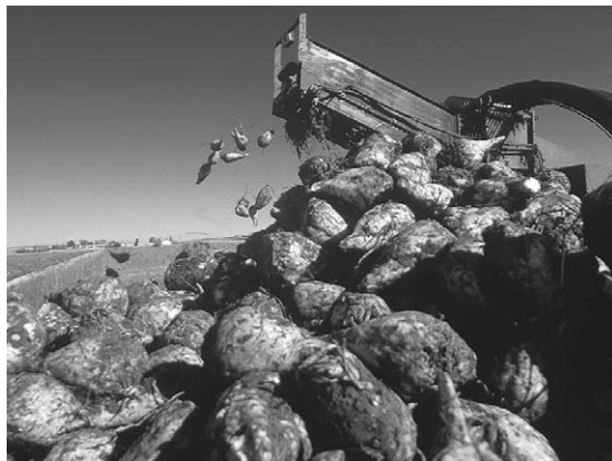
Sugarbeets are a major crop in the Nebraska Panhandle. Research answered questions about how to improve production.

proper beet variety is key to producing high quality beets and dealing with production problems such as weather, disease, insects or irrigation.