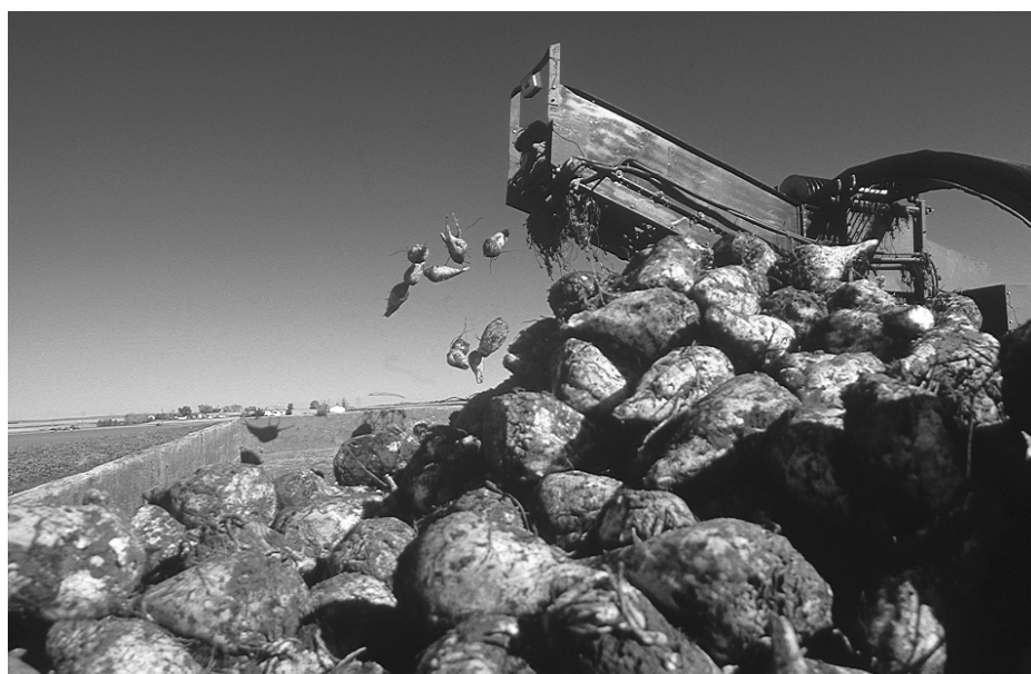
IANR research provided the scientific foundation for the flat iron steak, which is among the promising new beef products. It comes from the top shoulder of the chuck, which traditionally is used for roasts or ground beef.

These new products offer economical new beef cuts for cost-conscious consumers and boost beef carcass value. The flat iron steak, for example, costs less than traditional steaks. However, it brings more than twice as much as roasts and ground beef made from the top blade muscle. The value of the beef chuck and round relative to the rest of the carcass has increased since this research was completed.