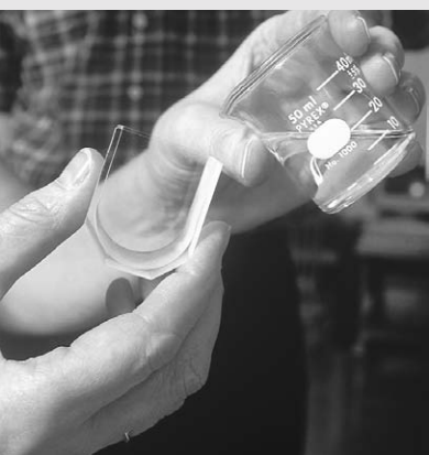
Cooking oil is poured into a cuvette so it can be tested with a near-infrared spectrometer.

There's lots of interest in methods that eliminate the use of hazardous chemicals so the Nebraska team studied more efficient, environmentally friendlier ways to check oil quality.