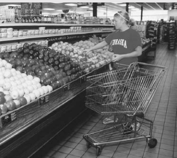
Consolidation usually affects food prices.

Results suggest that although concentration led to lower costs in most cases, the market power effect more than dominated the cost-efficiency effect associated with rising concentration, resulting in higher food prices in most industries.