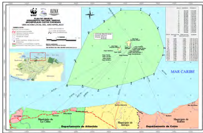
Figure A. Location of the Cayos Cochinos Marine Protected Area