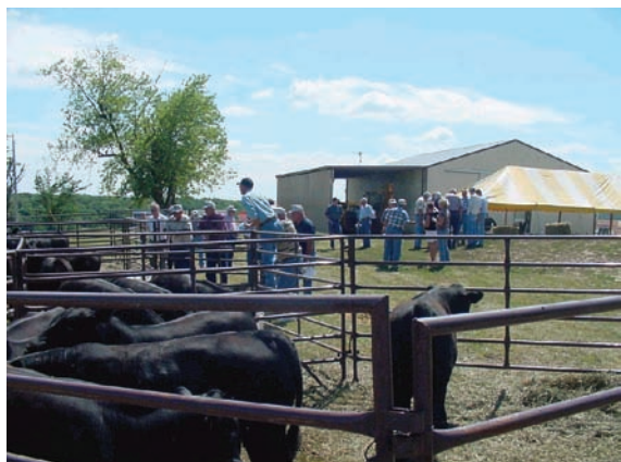
The group had the opportunity to discuss and view breeding stock at the Brinkley Angus Ranch.

partnership with Stephenson-Basin Angus Ranch in Montana. Each year, several hundred head of bulls are fed out for the farm and others. The tour group also enjoyed the scenic tour along the Mississippi River before arriving at Nauvoo, Illinois for a brief visit about the area.