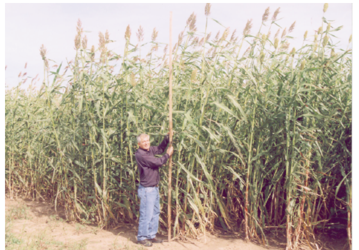
A taller the stand of sweet sorghum will result in thicker stalks and more juice production.

FEATURE UNIT - AGRONOMY RESEARCH AREA - Cont. on P. 2