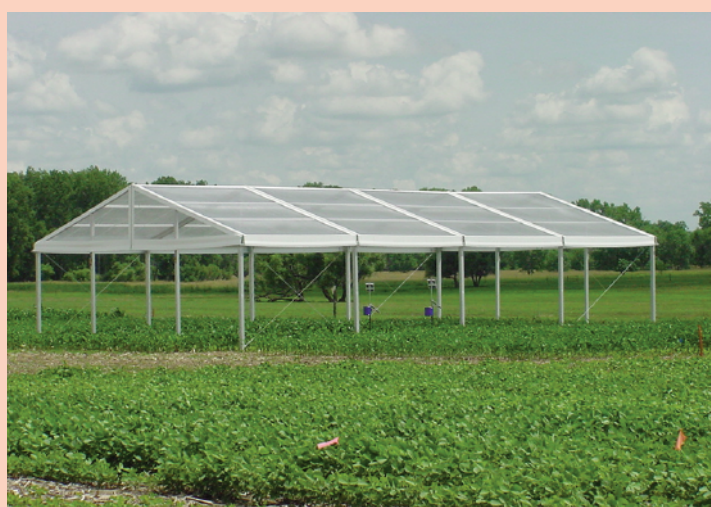
The stress mitigation tent at the ARDC simulates drought conditions for teaching sessions during the Crop Management Diagnostic Clinics.

The conditions created by the tent allow diagnostic clinic participants to learn about corn root and hybrid dynamics during stress conditions and how nutrient and water uptake in corn is impacted by drought stress conditions....during a year when we have had a rainy spring! □