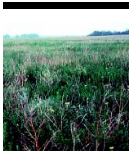
North Dakota CRP (USGS, NPWRC)

Conservation Reserve Program fields clearly are of greater value to breeding birds in the northern Great Plains than are croplands that they replaced. Nonetheless, the continuing loss of native grasslands is a critical concern.