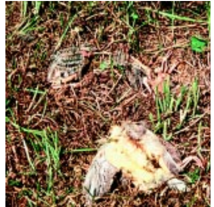
Nest mortality caused by haying (L. Igl)

Although the breeding season is the most critical time of year for most species, birds also need suitable habitat during the migration periods and winter. Few studies have examined bird use of CRP habitats in the Great Plains during those time periods. King and Savidge (1995) reported use in Nebraska by American tree sparrows, ring-necked pheasants, red-winged blackbirds, western meadowlarks, horned larks, and northern bobwhites. Delisle and Savidge (1997) noted only American tree sparrows, ring-necked pheasants, and meadowlarks (eastern and western meadowlarks were not distinguishable) wintering on their Nebraska study areas. For Kansas, Best et al. (1998) indicated that American tree sparrows, ring-necked pheasants, meadowlarks, northern bobwhites, and dark-eyed juncos were fairly common in CRP fields.