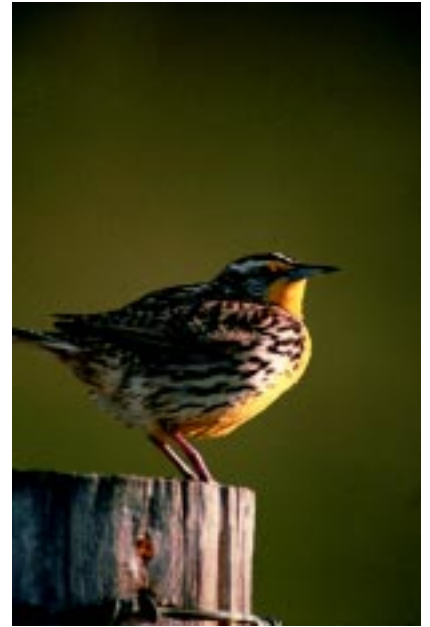
Western meadowlark (K. Hollingsworth)

Fortunately, in the Great Plains of the United States, the majority of land enrolled in the Conservation Reserve Program has been planted to grasses, often mixed with legumes. The result has been an enormous conversion of