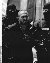
Suspected leader of sex trafficking in Macedonia.

more difficult for prosecutors to identify and punish those who are trafficking people.