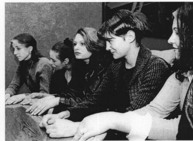
Moldovan and Romanian trafficking victims freed after a raid of a Bosnian brothel.

The vast majority of women in prostitution don't want to be there. Few seek it out or choose it, and most are