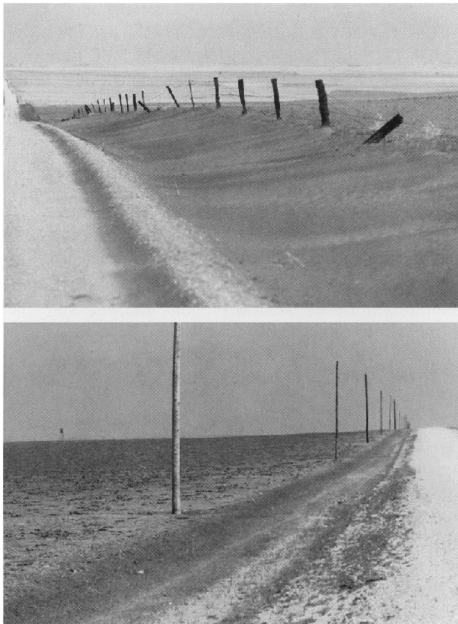
Figure 2. Post-burning, wind-induced soil erosion and loss on Conservation Reserve Program (above), and field versus native shortgrass prairie (below) at Keota, Colorado, June 2002.

An additional issue involving the nature of the grassland landscape is to consider the development of spatial heterogeneity (Rice et al. 1998). Small native communities are important components to grassland diversity and may not reflect the dominant vegetation of a biome. Restoration actions must match grasses or other species to the immediate surroundings rather than to the bioregion (Searchinger 2002). A working example is to create shortgrass prairie in a sand-sage prairie landscape.