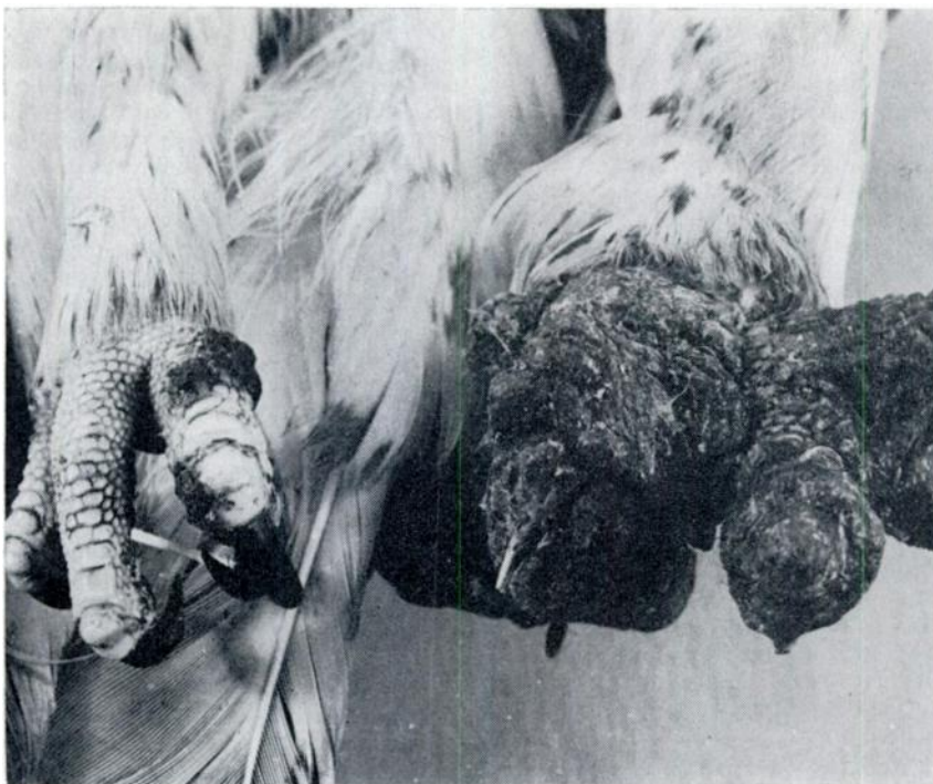
FIGURE 1. Feet of rough-legged hawk with pox infection.

by the 98th day post-inoculation. Histologically, the skin lesion on the first red-tailed hawk was similar to the smaller lesions in the rough-legged hawk.