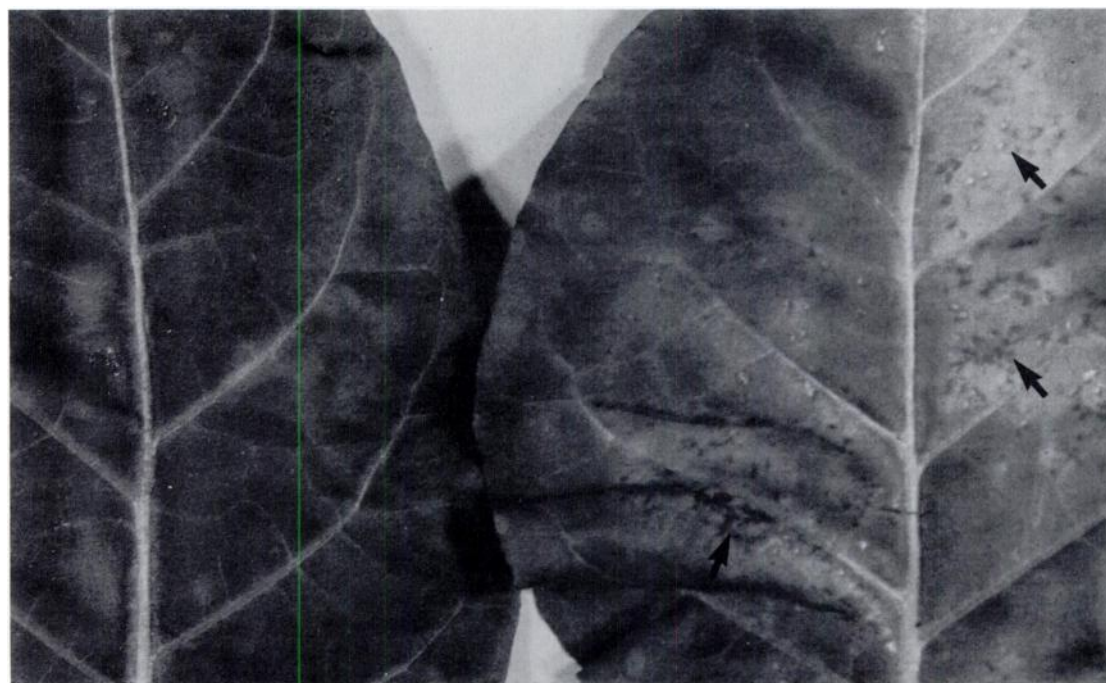
Figure 1. Leaves of a local lesion tobacco host plant inoculated with glutaraldehyde-treated TMV-RNA (left) and native TMV-RNA (right) 2 days after inoculation. Only the leaf inoculated with native RNA shows local lesions (arrows).

precipitating BMV- and TMV-RNAs with Mg^{2+} , collecting the pellets by low-speed centrifugation, and overlaying them with buffered 2.5% glutaraldehyde. The pellets rapidly dissolved. The solution initially was colorless but turned a clear yellow in 1 hr at room temperature. When glutaraldehyde fixative buffered with 0.1 M borate, pH 9.1, or 0.2 M cacodylate, pH 7.2, and containing sufficient Mg^{2+} to precipitate a 4% solution of BMV-RNA was layered over a Mg^{2+} -precipitated BMV-RNA pellet, the pellet again dissolved. The mixture was vortex stirred and left at room temperature for 1 hr without formation of a precipitate or gel and without change in pH. Magnesium-precipitated RNA did not dissolve when overlaid with buffered glutaraldehyde containing a fivefold or larger excess of Mg^{2+} . After 1 hr at room temperature the precipitated glutaraldehyde-reacted RNA pellet had changed from a white and opaque to nearly transparent and gelatinous appearance. The pellet readily dissolved in buffer, however, and RNA was not cross-linked.