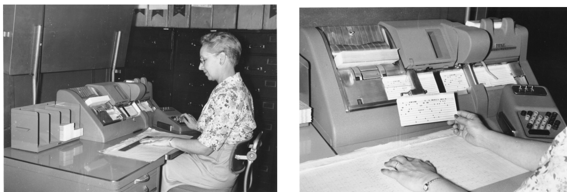
Figure 5. One of the statistical clerks (left) at the National Runoff and Soil Loss Data Center transferring information onto computer punch cards (right) during the 1950s.

The successful accomplishments of employees at the NRSLDC supported efforts in the 1970s to gain congressional