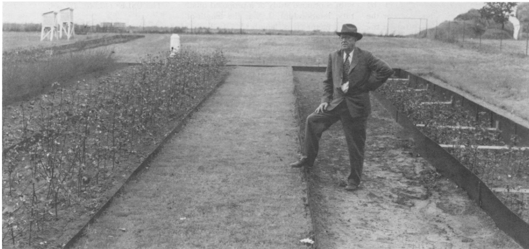
Figure 3. Hugh H. Bennett, Chief, Soil Conservation Service, inspecting erosion research plots at the Red Plains Conservation Experiment Station near Guthrie, Oklahoma (photo courtesy of SWCS/JSWC).