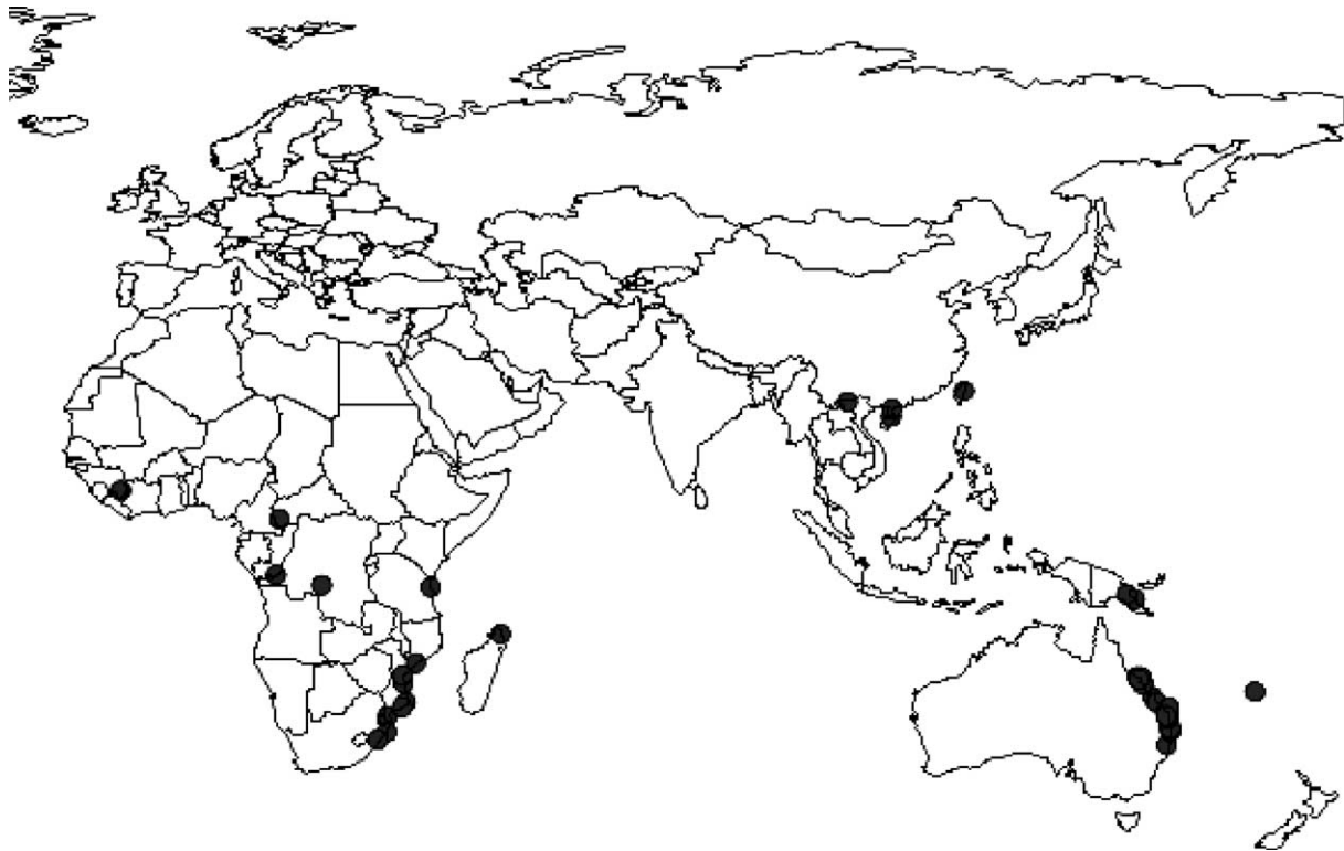
Fig. 2. A CLIMEX map showing the similarity of West Palm Beach, Florida with locations in the native range of L. microphyllum . Dots represent a 70% climate match or better.

suppress plant growth and its narrow host range. However, recent observations of Queensland population of the mite indicated that the mites performed poorly on the Florida form of L. microphyllum compared to the Queensland form of L. microphyllum (Goolsby, unpublished data). This suggests the genotypes may be host races of the mite. Searches for a F. perrepae race or biotype that is better suited to the Florida genotype of L. microphyllum are underway.