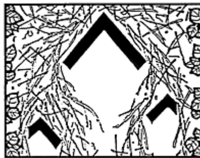
Figure 4. Modified shank arrangement for a shovel-type cultivator to allow residue flow.

On older cultivators, shanks often are arranged in a V-shape formation ( Figure 3 ). This arrangement concentrates residue into the trailing center shank that can cause plugging. This plugging problem can be remedied by removing shanks, using wider sweeps, and changing the shank arrangement to an inverted V-shape ( Figure 4 ). This allows the residue to flow past the first shovel and to be distributed evenly between the two shovels near the row.