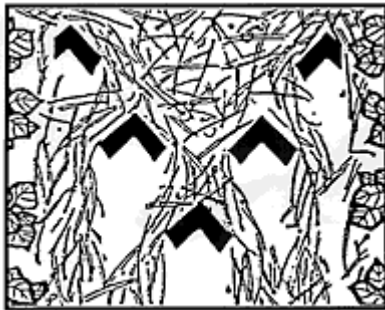
Figure 3. Conventional shank arrangement for a shovel-type cultivator.

Cultivators with five shanks per row have difficulty maintaining residue flow through the row units. One solution is to remove some shanks and place wider sweeps on the remaining shanks, especially the one centered between rows. Some farmers also change shank arrangement.